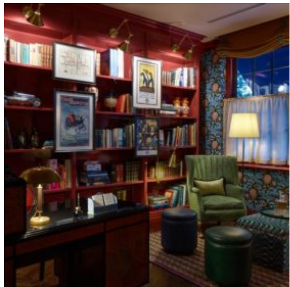
The Library - Host Area