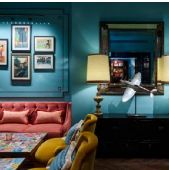
Sir Frank's Bar