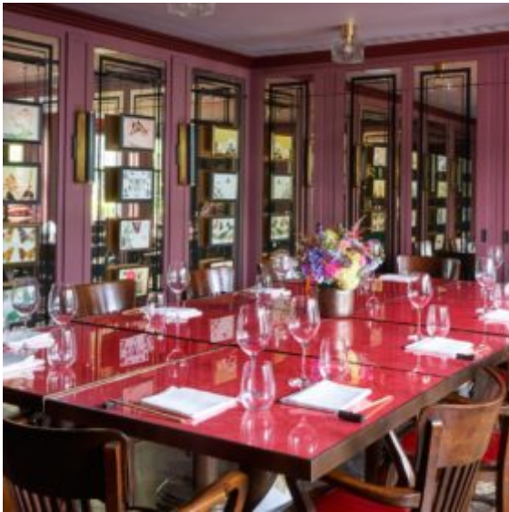
The Butterfly Room