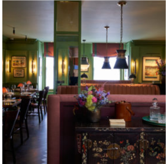
The Fuji Grill