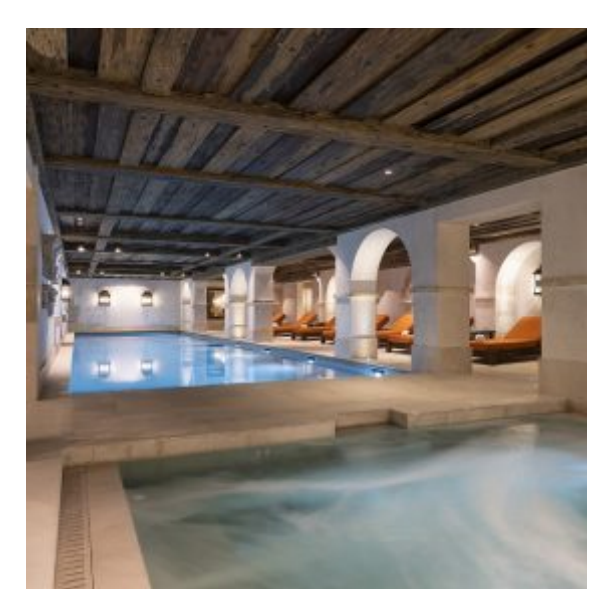
Guerlain Spa indoor swimming pool area