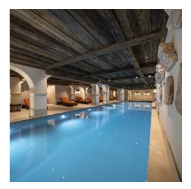
Guerlain Spa indoor pool