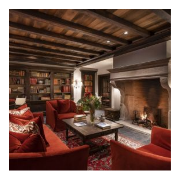
Lobby seating area