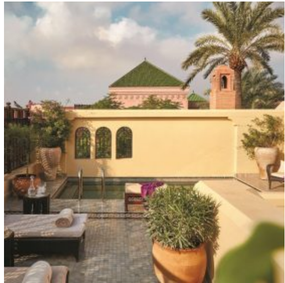
Riad rooftop terrace