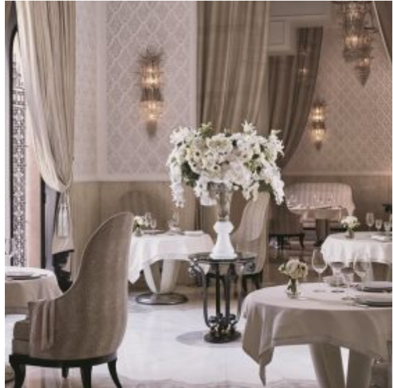
La Grande Table Francaise