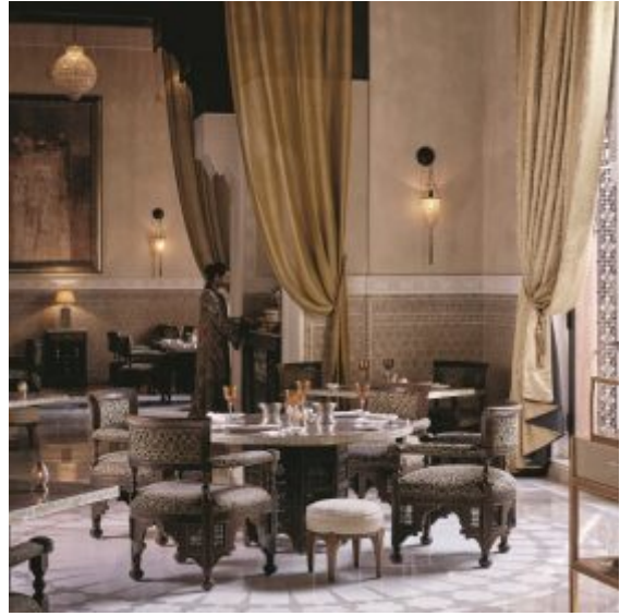
La Grande Table Marocaine