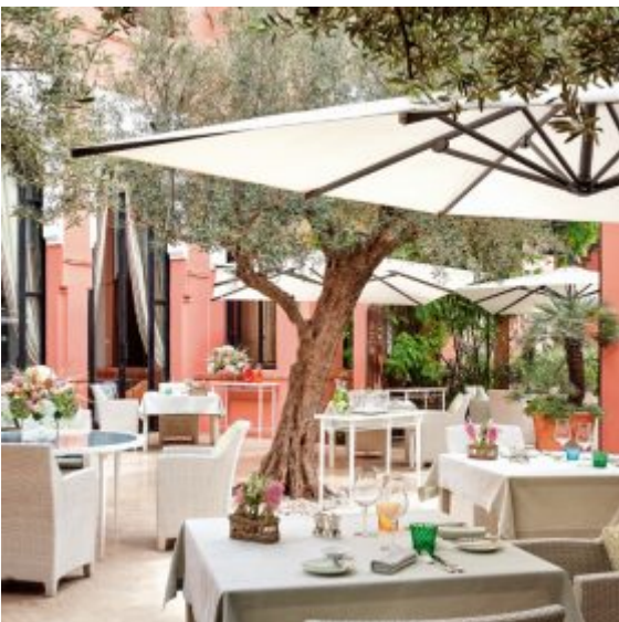
La Table restaurant