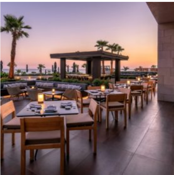
Matsuhisa Limassol Patio