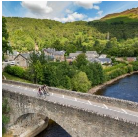
Bicycle hire - country pursuits and activities