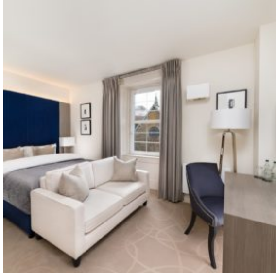
Simply elegant suites