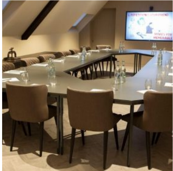
The Library meeting room