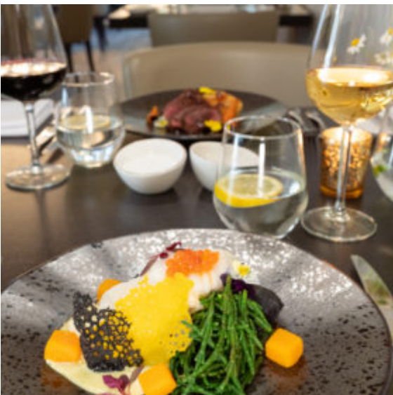
Monadh fine-dining restaurant