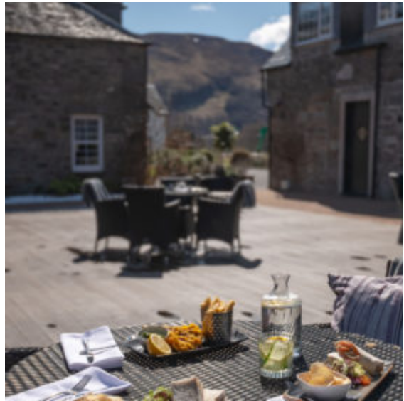
Courtyard and outdoor terrace