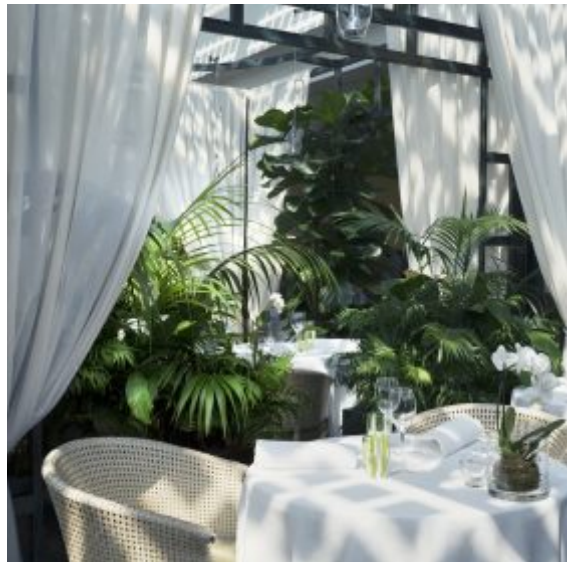
La Grande Limonaia restaurant