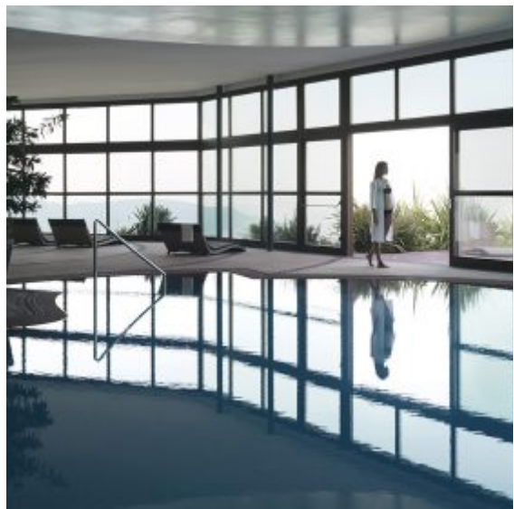
Indoor and Outdoor Pool