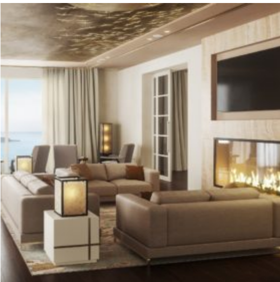
Lefay SPA Treatment Gazebo