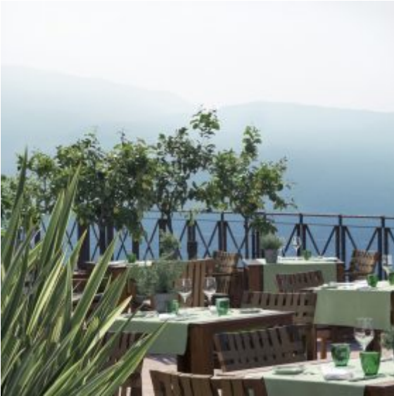
Trattoria La Vigna restaurant