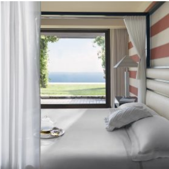
Royal Suite Master Bedroom