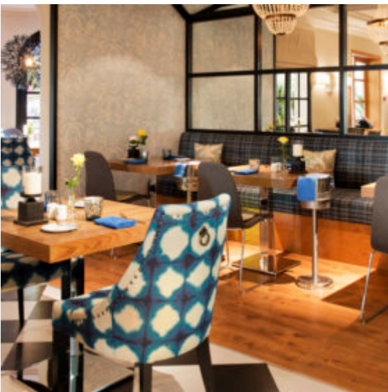
La Brasserie by Pierre Résimont