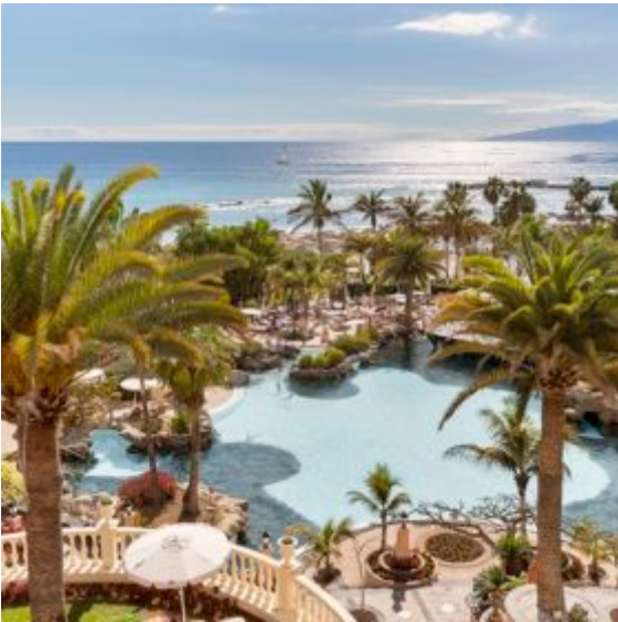
Exterior pool and sea view