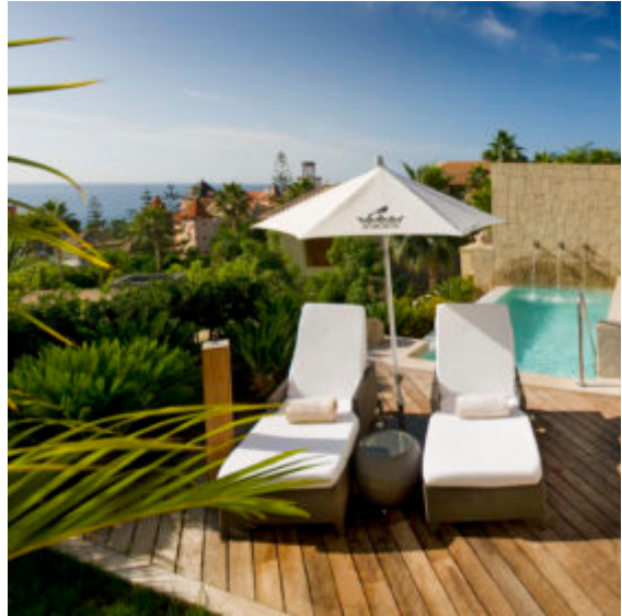
Las Palmeras villa