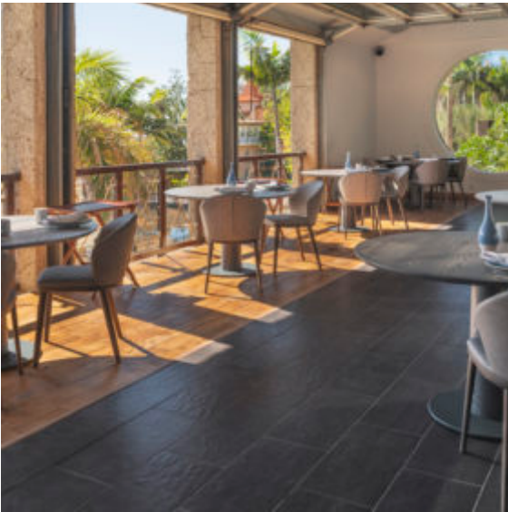
Nub - Michelin-starred restaurant