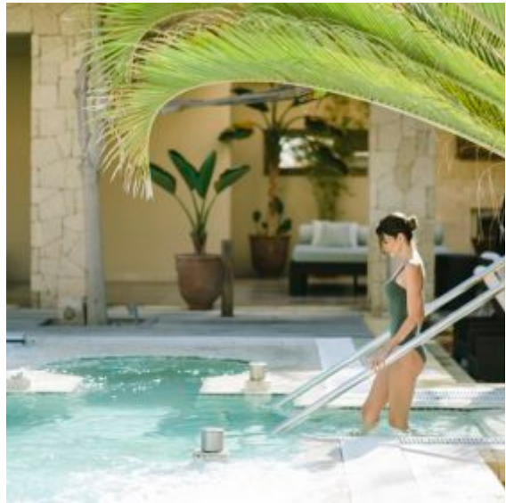
Bahia Wellness Retreat - Thalassotherapy Spa