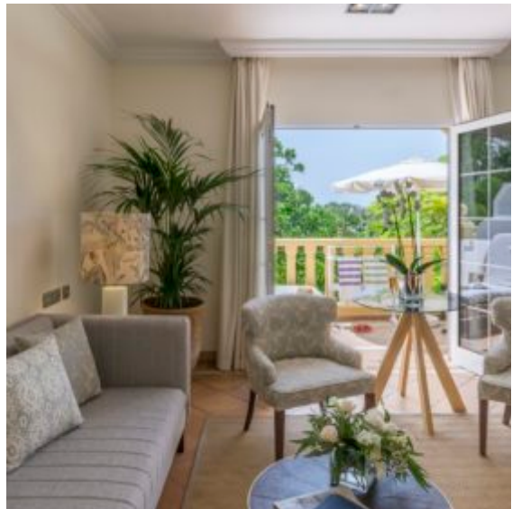
Casas Ducales -Suite garden view