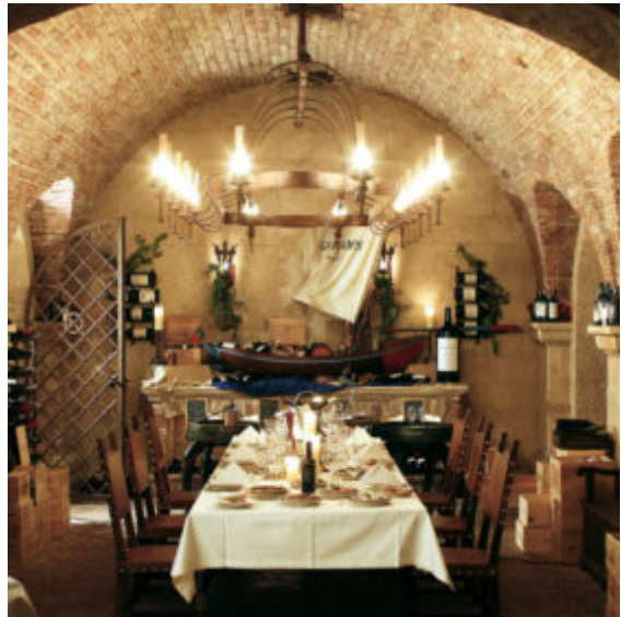
Cave dos Vinhos, wine cellar