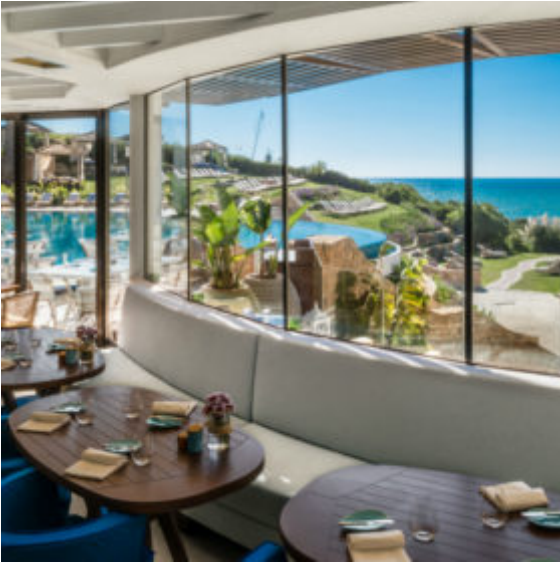
Whale bar and restaurant