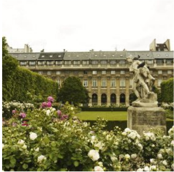
Palais Royal gardens