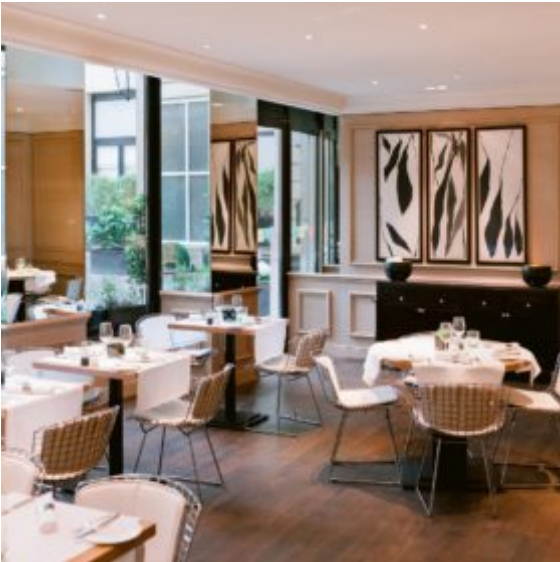
Le Lulli restaurant