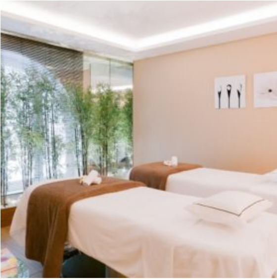
Carita Spa treatment room