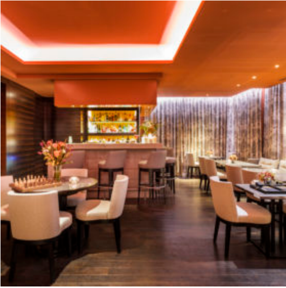
Le Lulli lounge bar