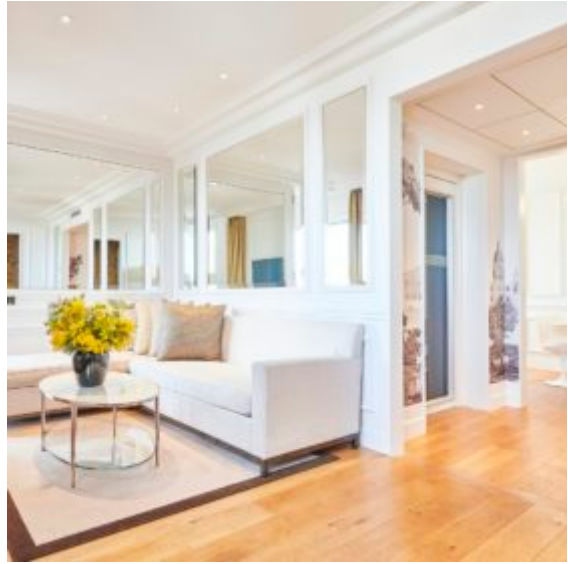
Panoramic Suite living area