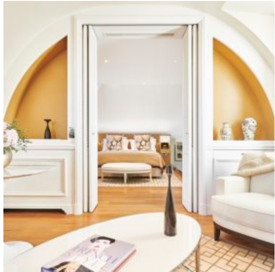
Royal Palace Suite