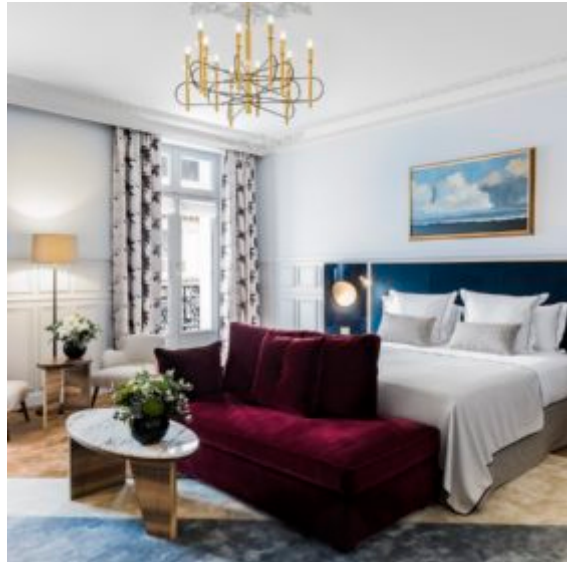
Prestige Junior Suite