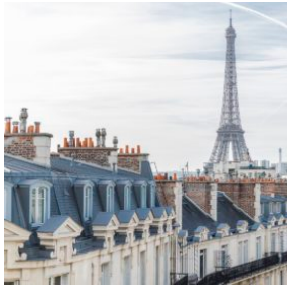
Eiffel Tower view