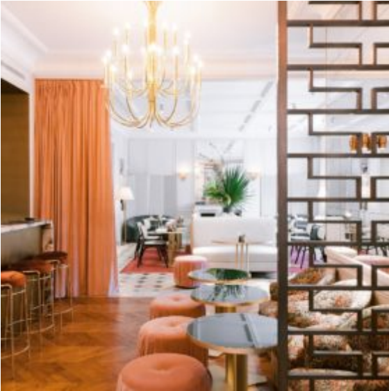
Bar and lounge area