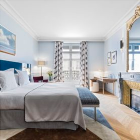
Deluxe Executive Room