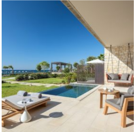
Bungalow Terrace with Private Pool