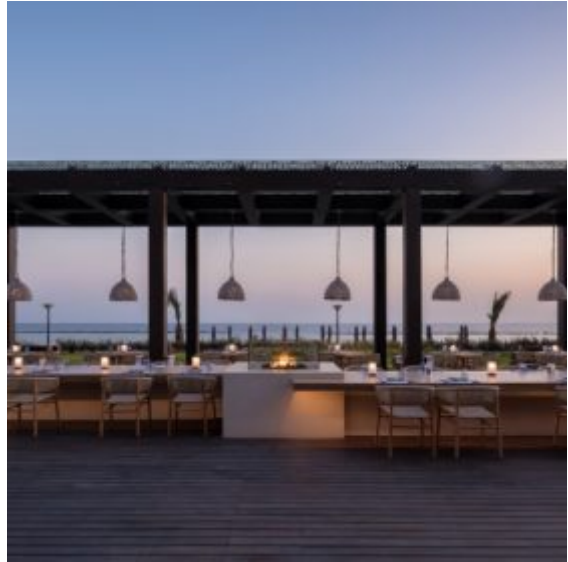
Armyra Restaurant at Sunset