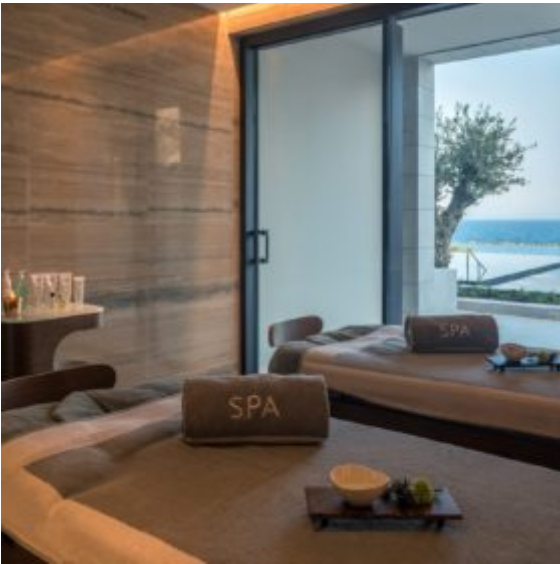
Spa treatment room