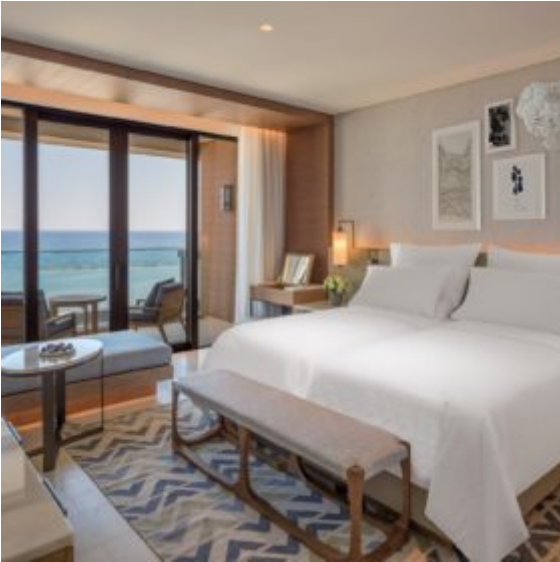
Deluxe Twin Room