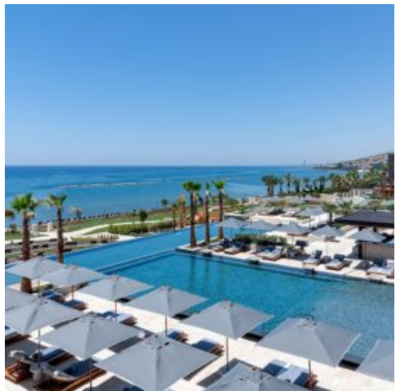
Infinity Edge Pool