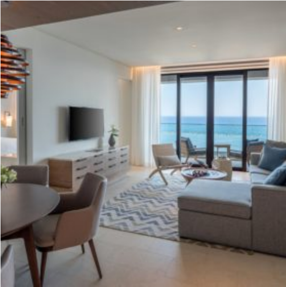
One Bedroom Deluxe Suite