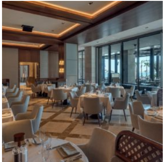
The Main Dining Room