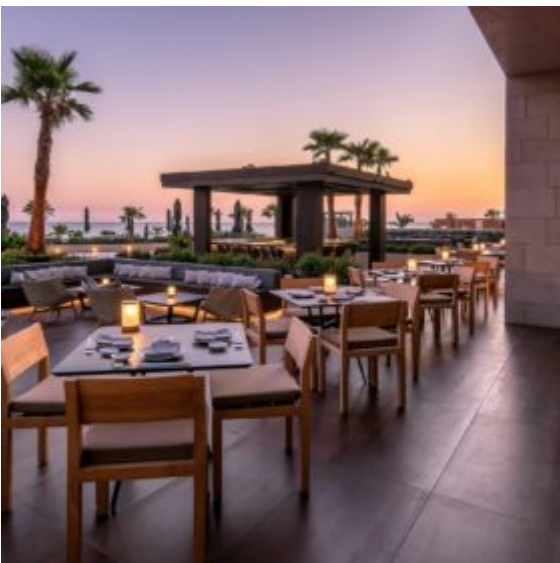
Matsuhisa Limassol Patio