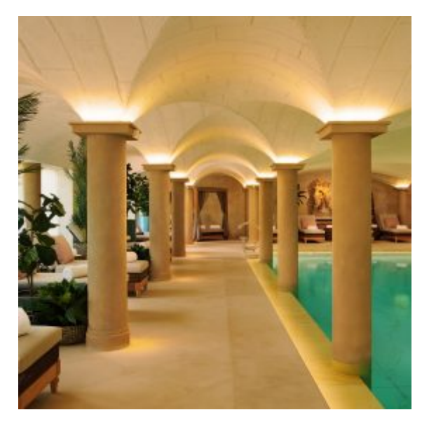
ELITE Spa pool