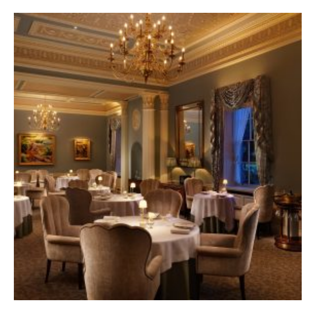
Shaun Rankin restaurant