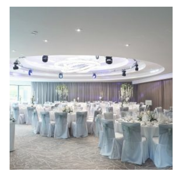
The Grantley Suite