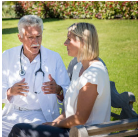
Doctor consultancy session