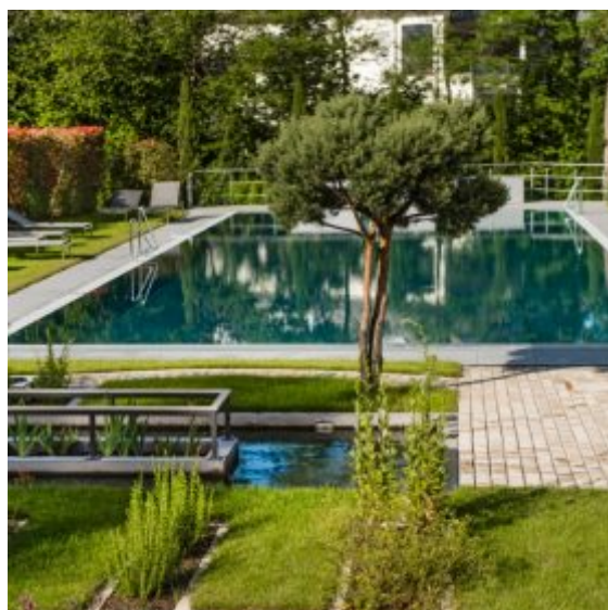
New Gardens & Swimming Pool