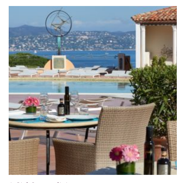
A Ciel Ouvert dining