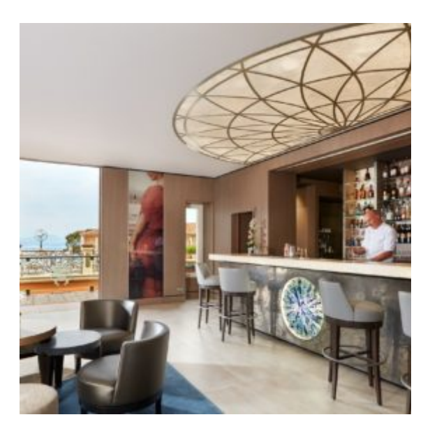
Le Soleil d'Eau Bar