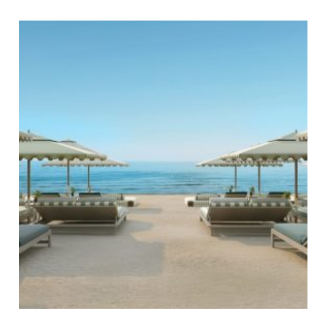
Jardin Tropézina beach