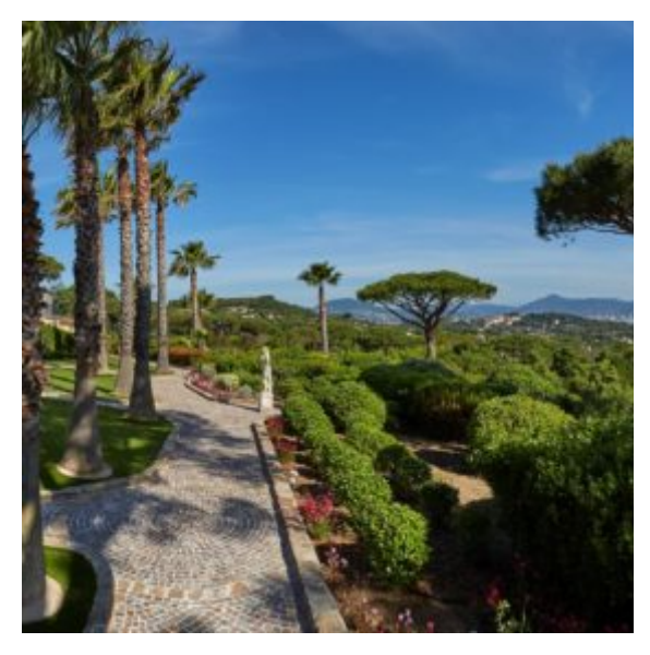
Exterior and gardens