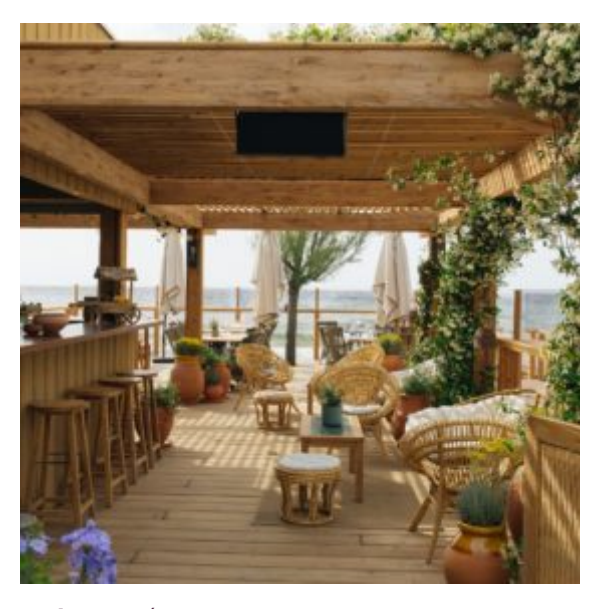
Jardin Tropézina restaurant