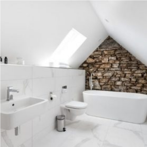
All modern comforts