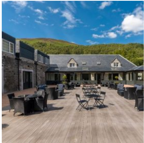
Courtyard and outdoor terrace