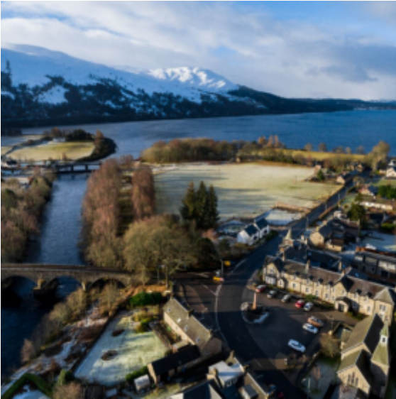
View of Loch Kinloch