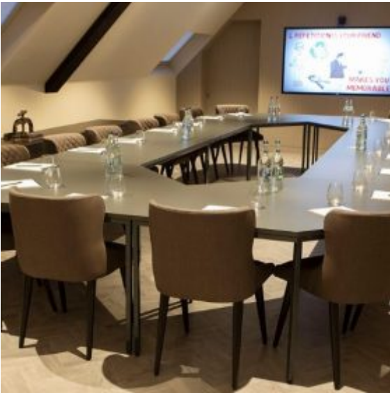
Meetings and away days