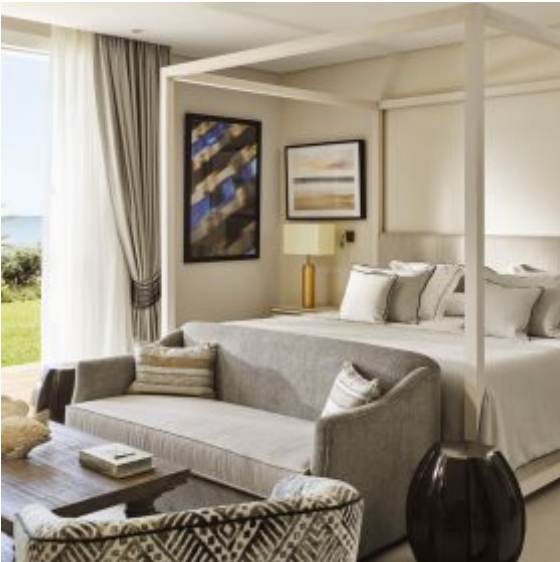
Villa Perez bedroom