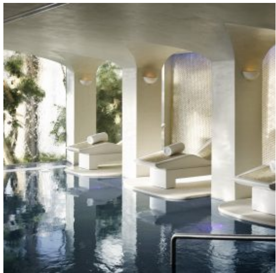
Six Senses Spa pool