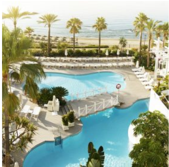
Puerto Romano Pool