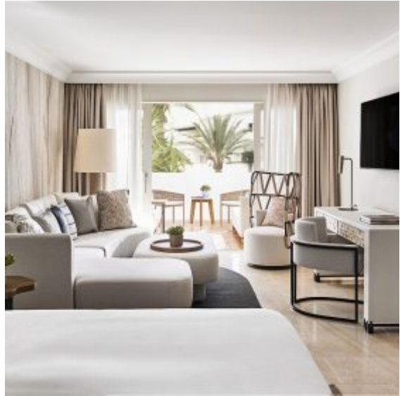
Grand Junior Suite