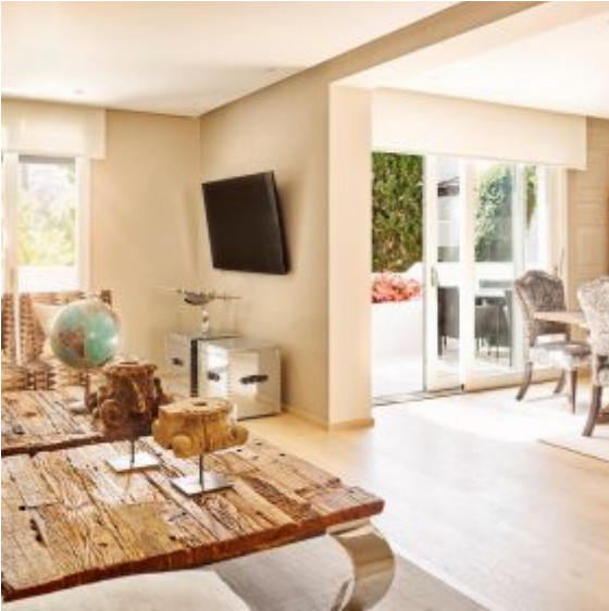
Puerto Real Suite