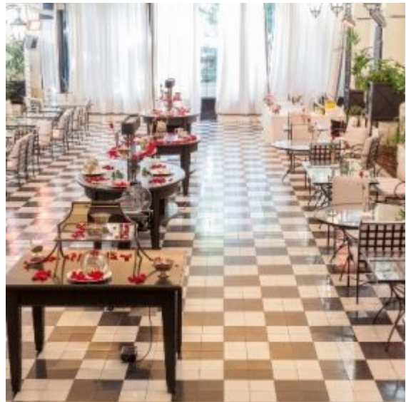
Le Jardin restaurant