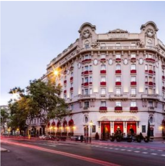
El Palace Hotel Barcelona