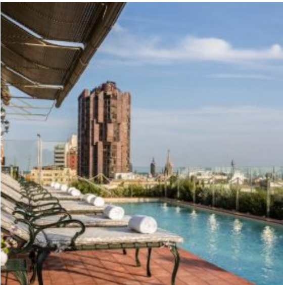
Rooftop pool and terrace