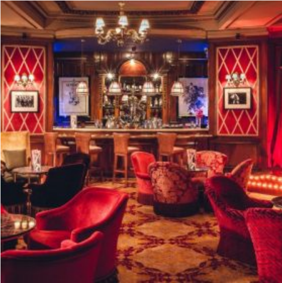
Bluesman Cocktail Bar