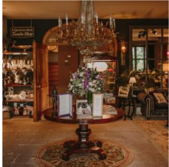
Cosy lounges and elegant spaces