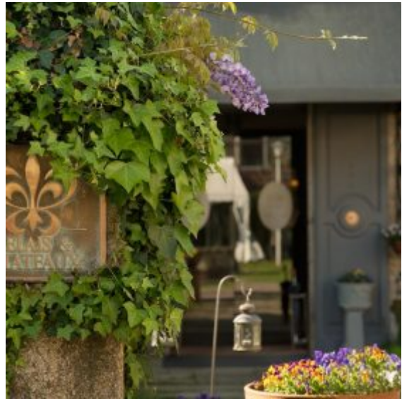
The only Relais & Chateaux in Galicia