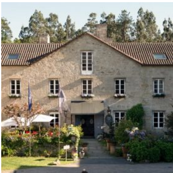
A Quinta da Auga