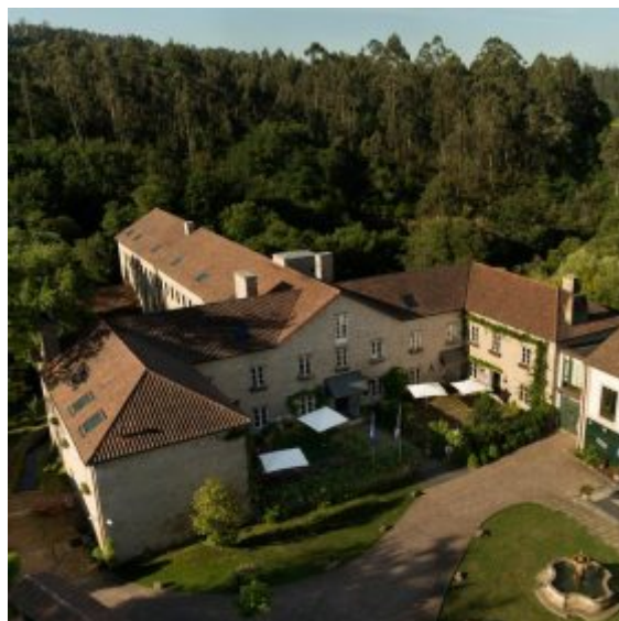
18th century paper mill