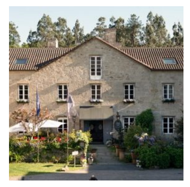
A Quinta da Auga