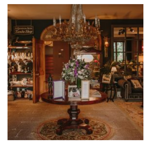
Cosy lounges and elegant spaces