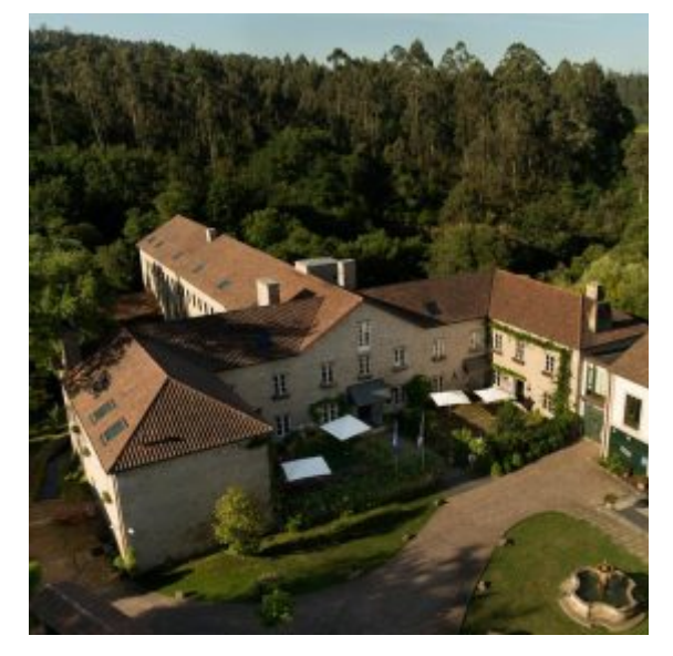
18th century paper mill