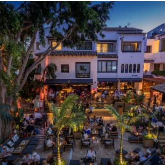
La Plaza by night