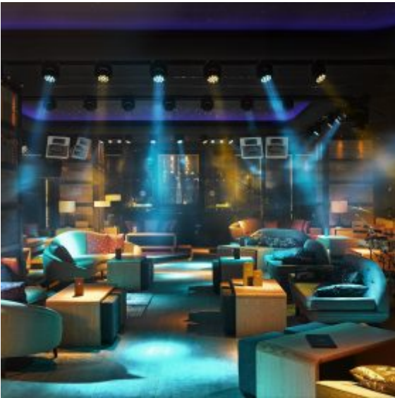
La Suite nightclub