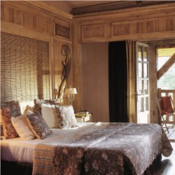
Le Vent Du Large suite