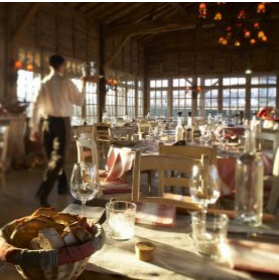
La Table Du Lavoir