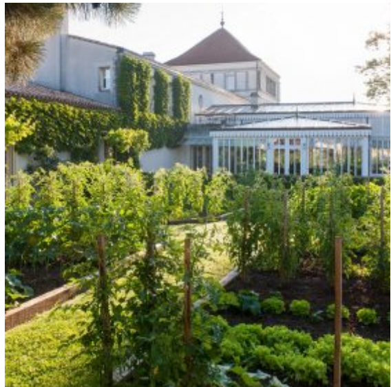
La Grand Vigne garden