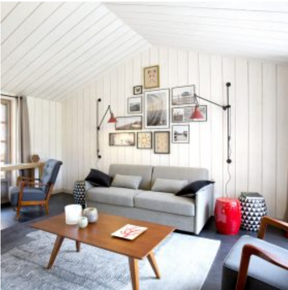
Signature Suite Living Room