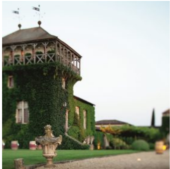
Chateau Smith Haut Lafitte exterior