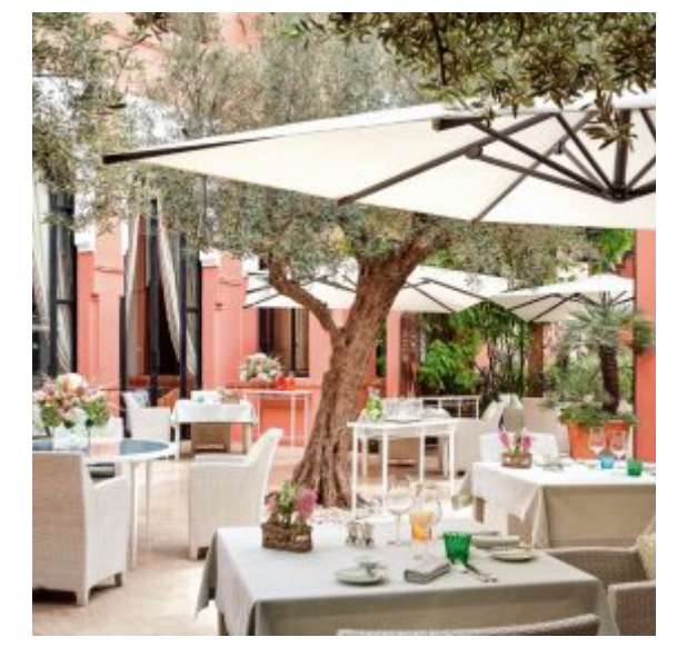
La Table restaurant