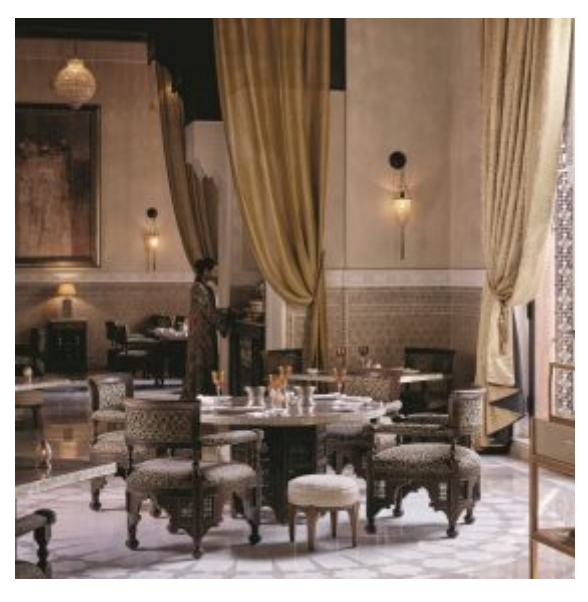
La Grande Table Marocaine