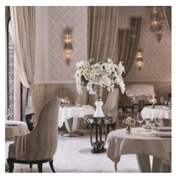
La Grande Table Française