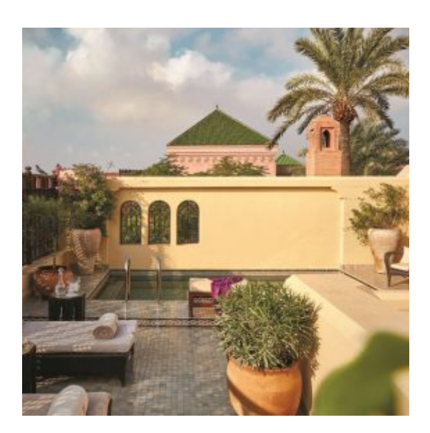
Riad rooftop terrace