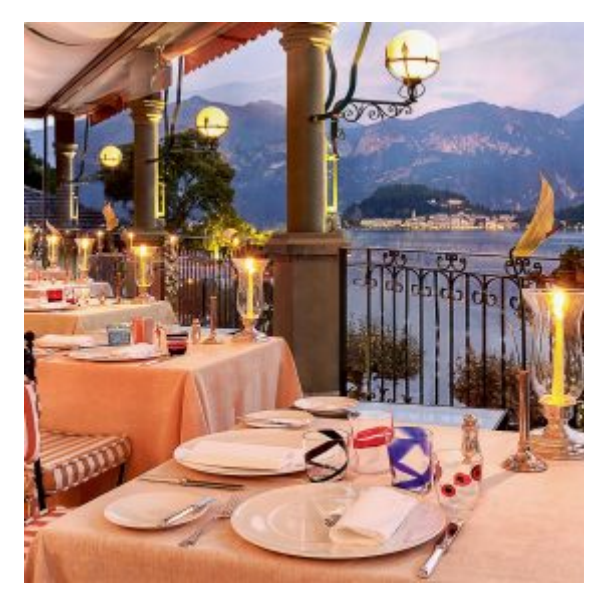
La Terrazza Restaurant