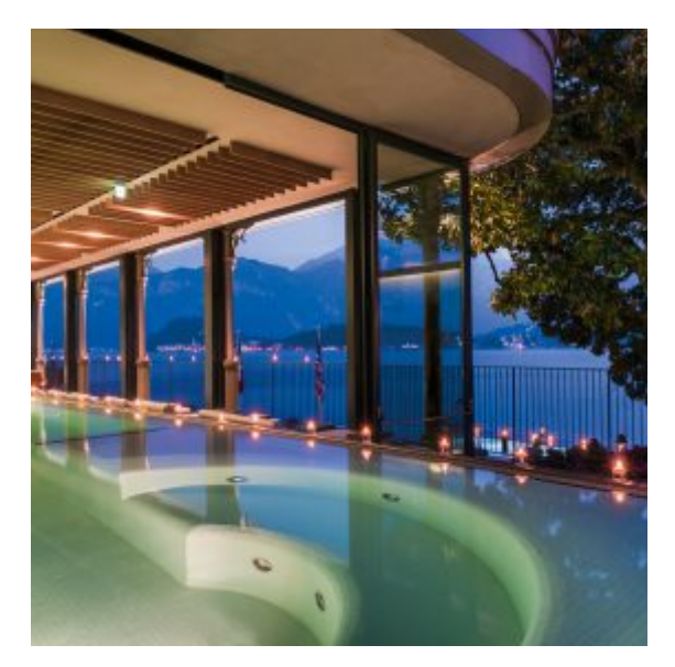
T Spa Infinity Pool