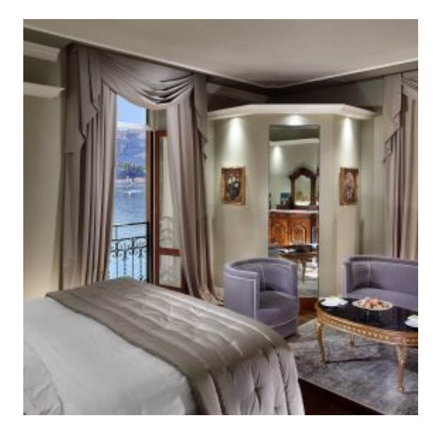
Lake View Deluxe Room