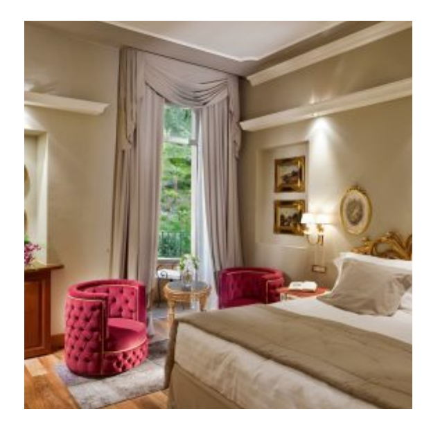
Park View Prestige Room