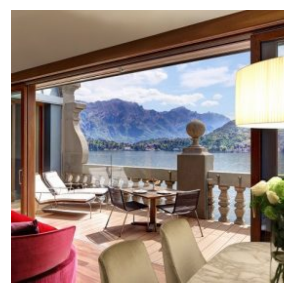
Rooftop Floor Front Suite