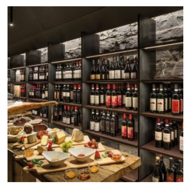
L'Escale Trattoria and Wine Bar