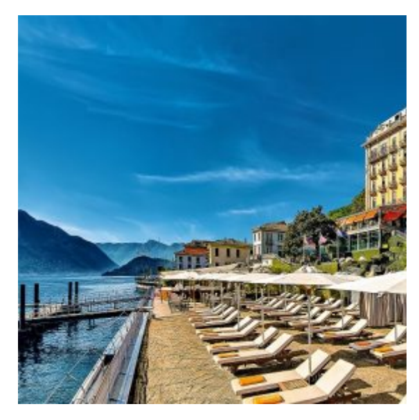
Hotel exterior and Pool