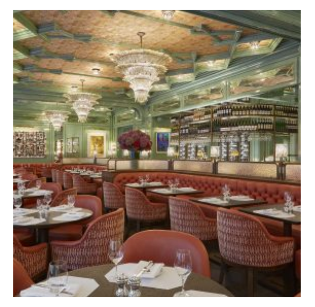
Baur's brasserie & bar