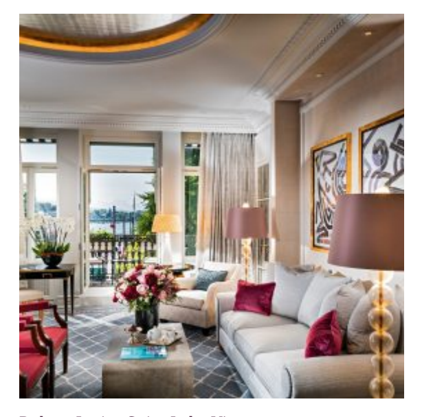
Deluxe Junior Suite Lake View