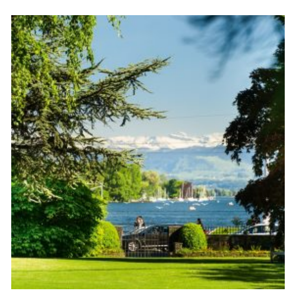
Baur au Lac Park