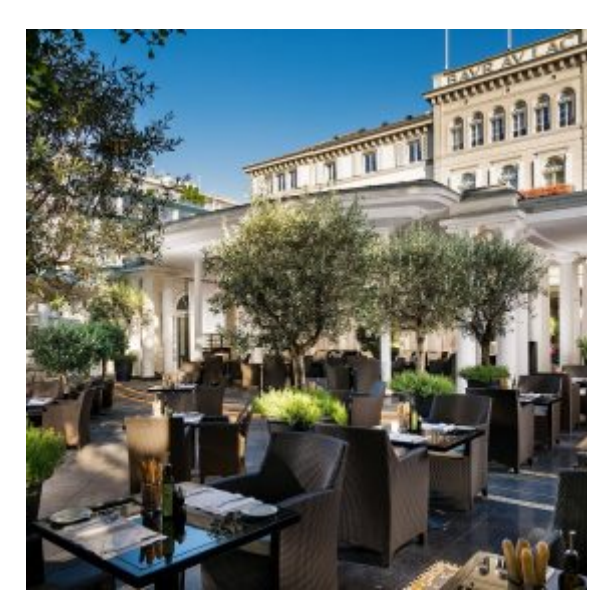
Baur au Lac Terrasse