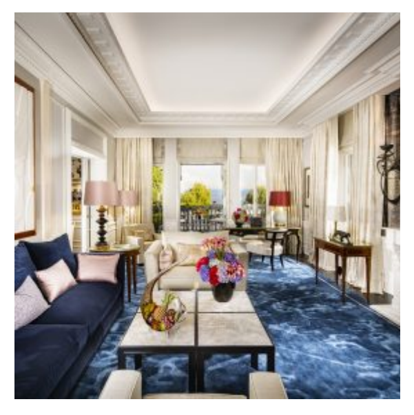
Deluxe Corner Suite