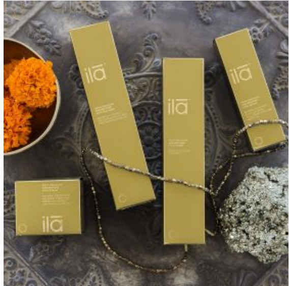
Beyond Organic Gold Cellular Age-Restore skincare