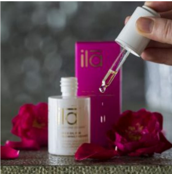
Beyond Organic Glowing Radiance skincare