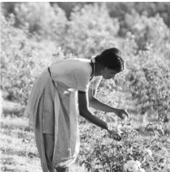
Organic ethical ingredients