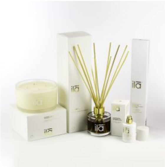
Beyond Organic Essence of Joy