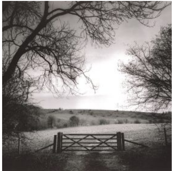
Cotswolds spa view