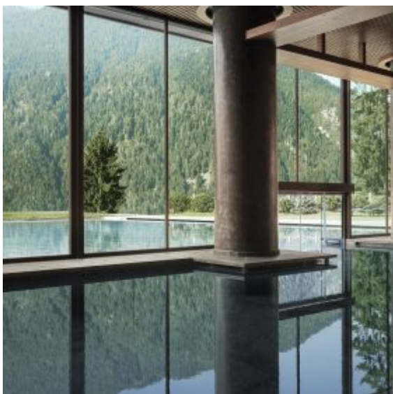
Indoor & Outdoor Pool in summer