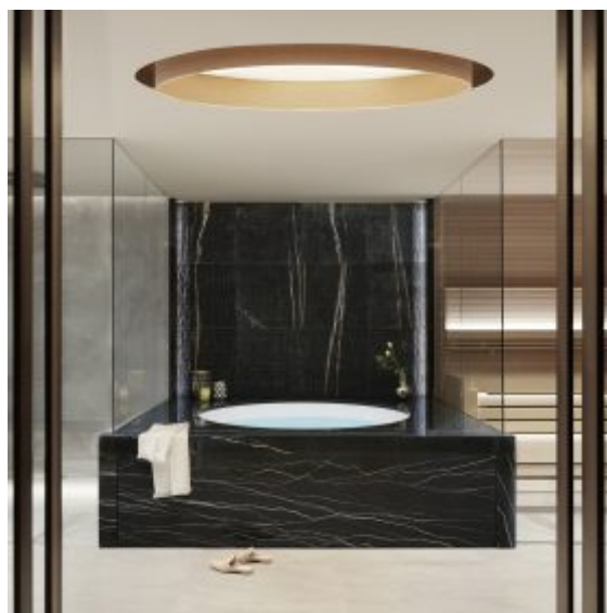
Exclusive SPA Suite bathroom