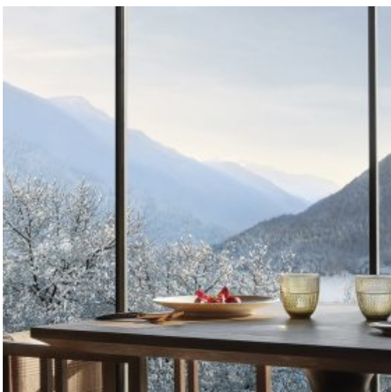
Dolomia Restaurant in winter