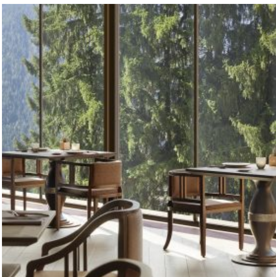
Dolomia Restaurant in summer