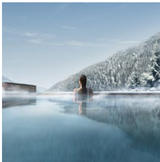
Heated outdoor pool