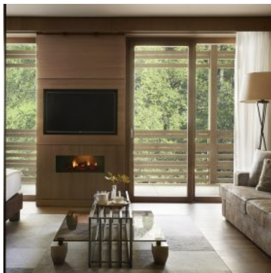
Prestige Junior Suite