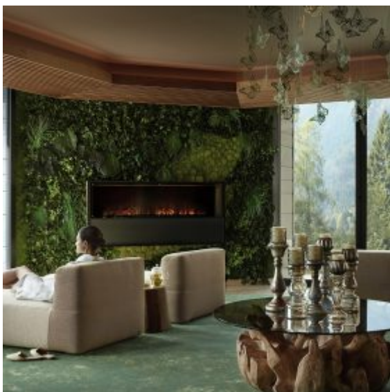
SPA relaxation area