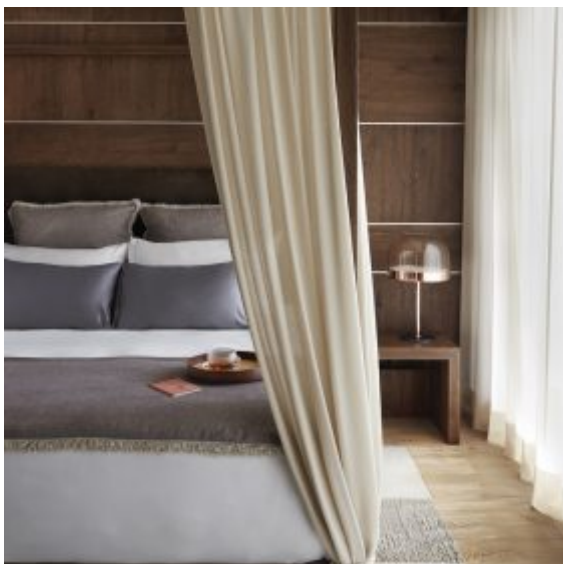
Royal Pool & Spa Suite