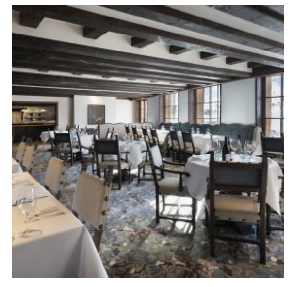
Le JOIA restaurant