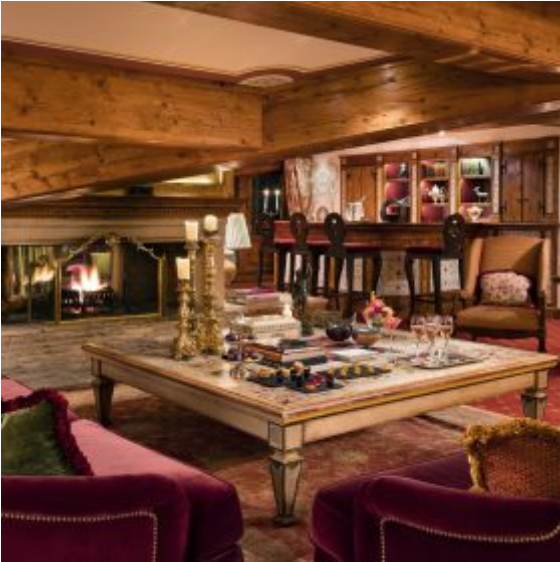
Private Penthouse living room