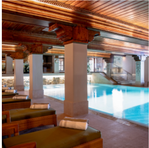
Spa swimming pool