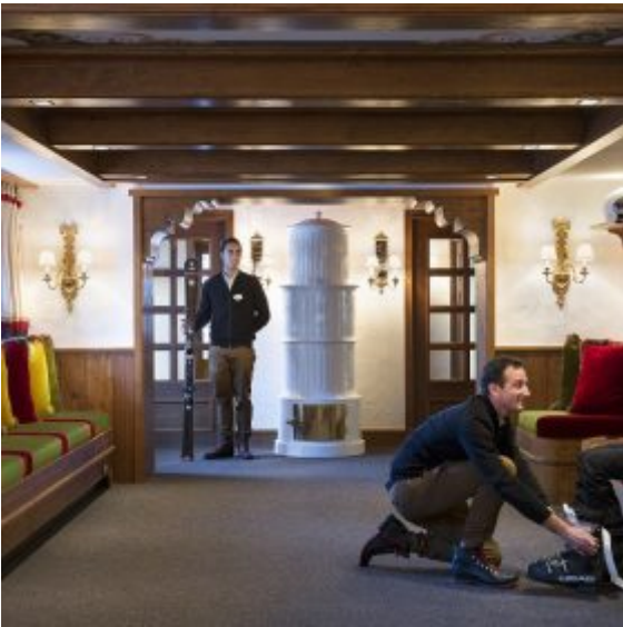
Private ski room