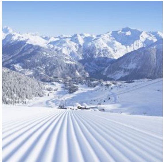
La Piste des Verdons