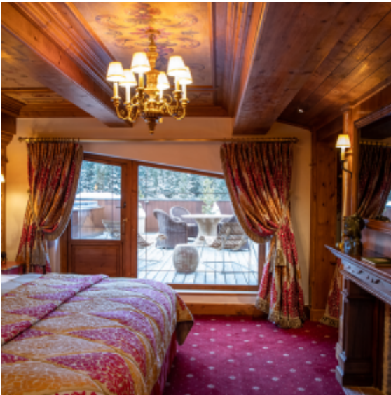
Private Penthouse bedroom