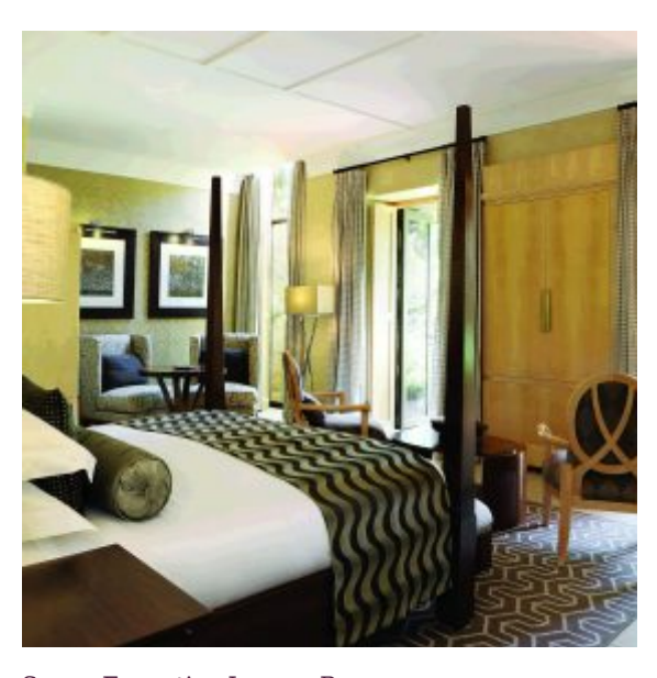
Saxon Executive Luxury Room