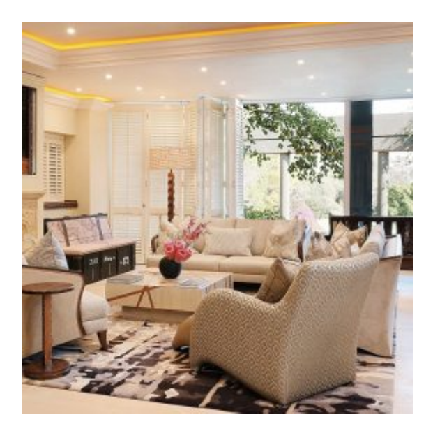
Nelson Mandela Platinum Suite