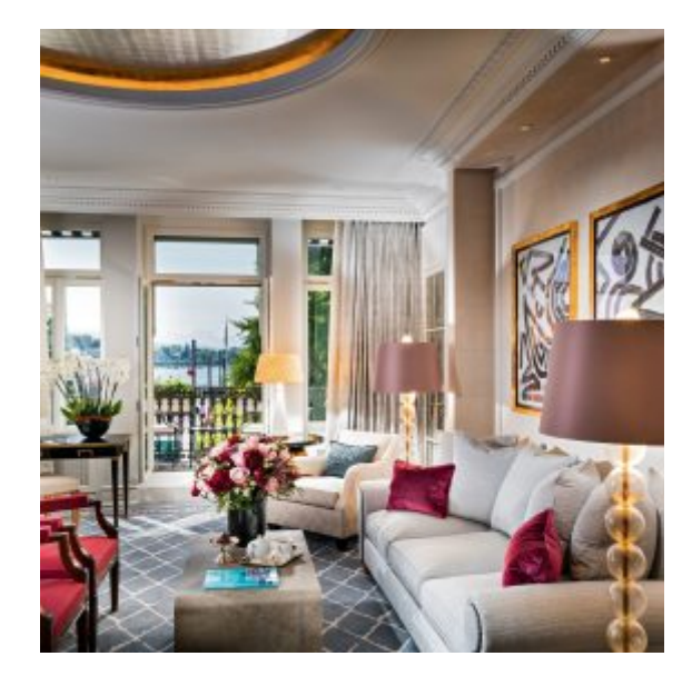
Deluxe Junior Suite Lake View