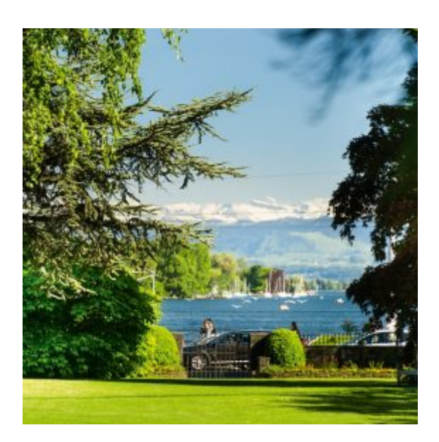
Baur au Lac Park