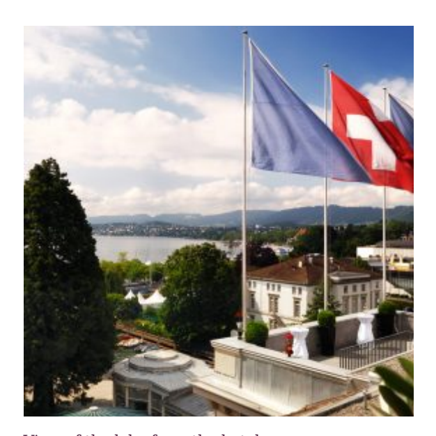
View of the lake from the hotel