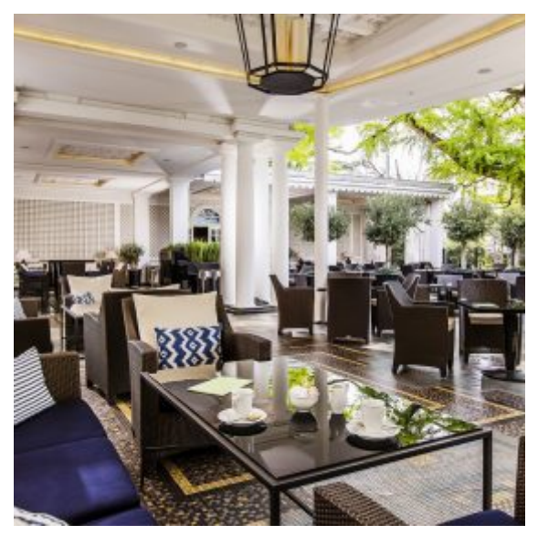
Rive Gauche Terrasse