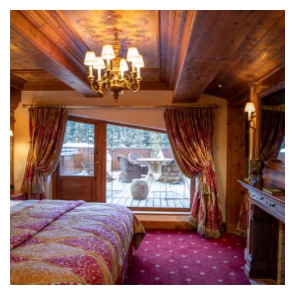
Private Penthouse bedroom