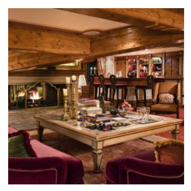
Private Penthouse living room