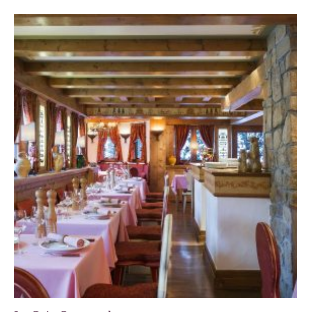
Le Coin Savoyard