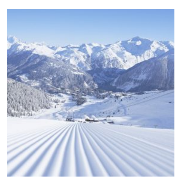
La Piste des Verdons