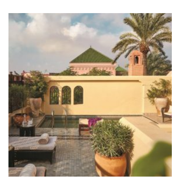
Riad rooftop terrace