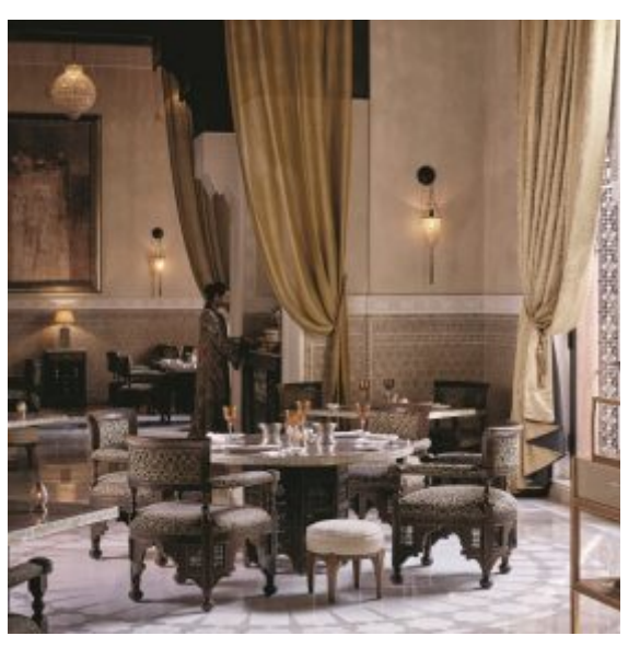
La Grande Table Marocaine