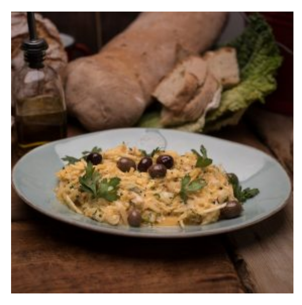
Delfina Restaurant cuisine