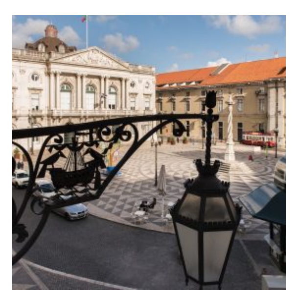
View from the Deluxe Rooms and Suites