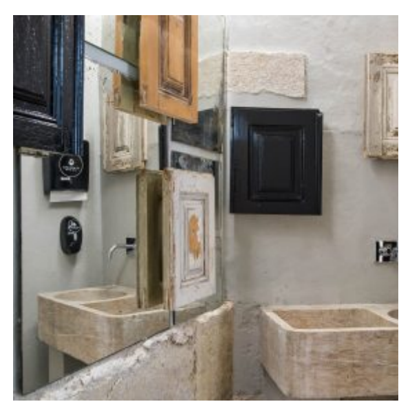
Interior public area