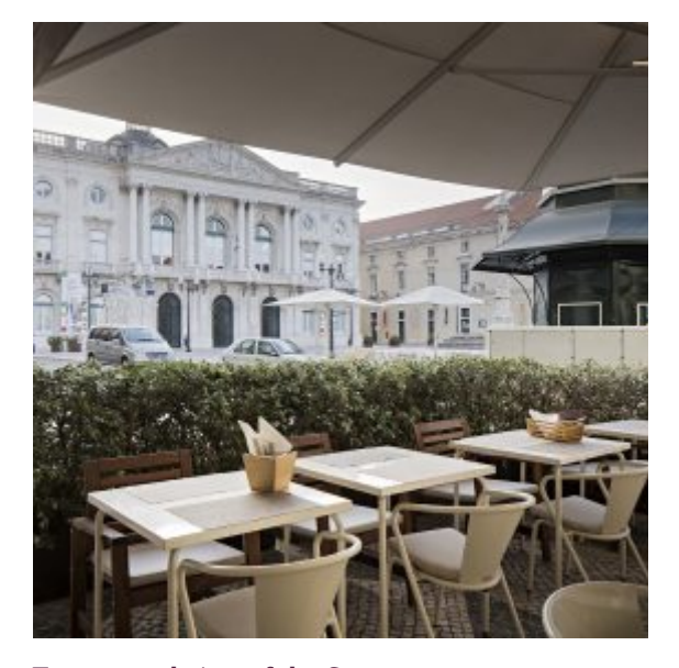
Terrace and view of the Square