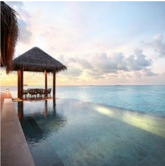
Three Bedroom Ocean Residence with 2 Pools