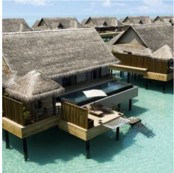
Sunset Water Villa with Pool