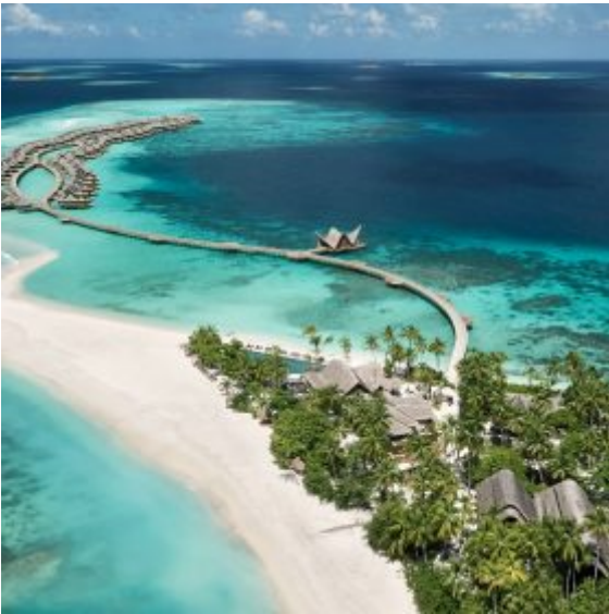
The island and arrival jetty