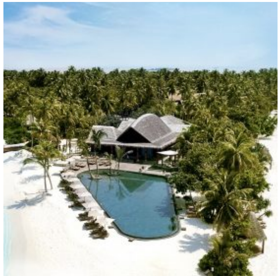
Mura Bar swimming pool area