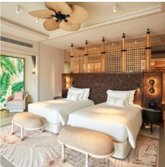
Four Bedroom Beach Residence with Pool