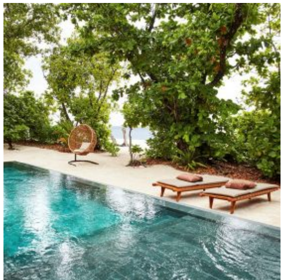
Luxury Beach Villa with pool