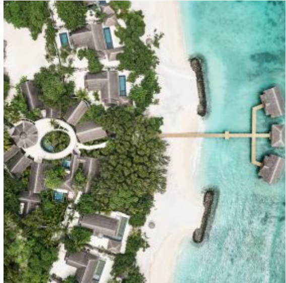
Spa centre by ESPA