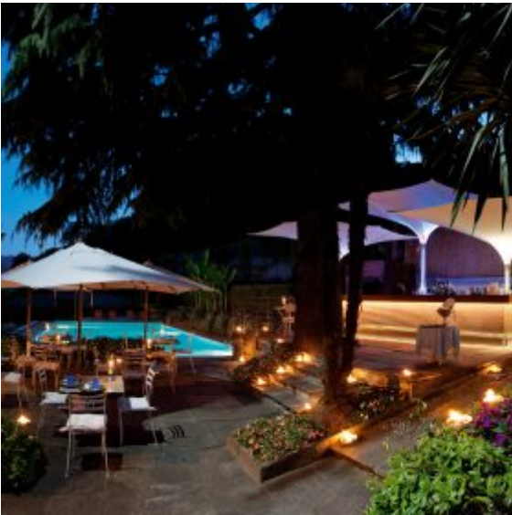
T Pizza by night