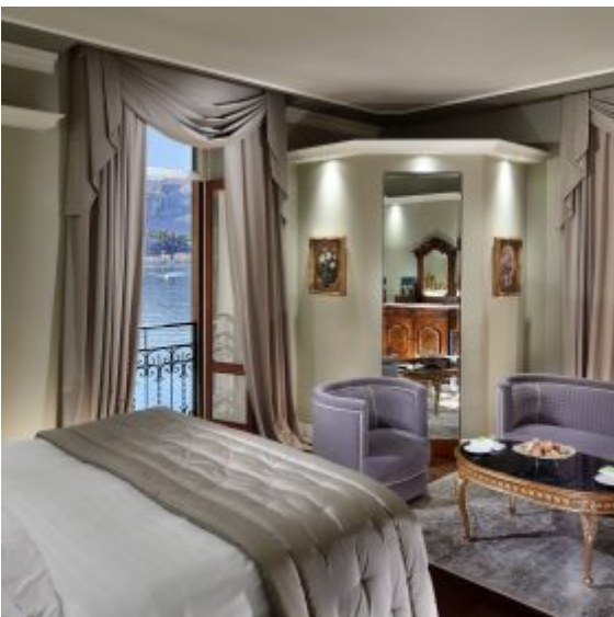
Lake View Deluxe Room