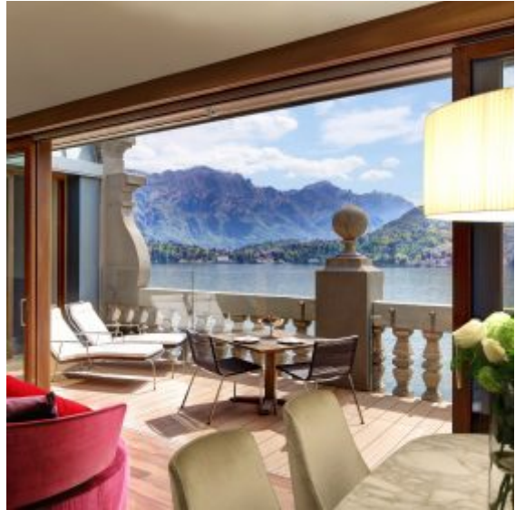
Rooftop Front Suite Living Room