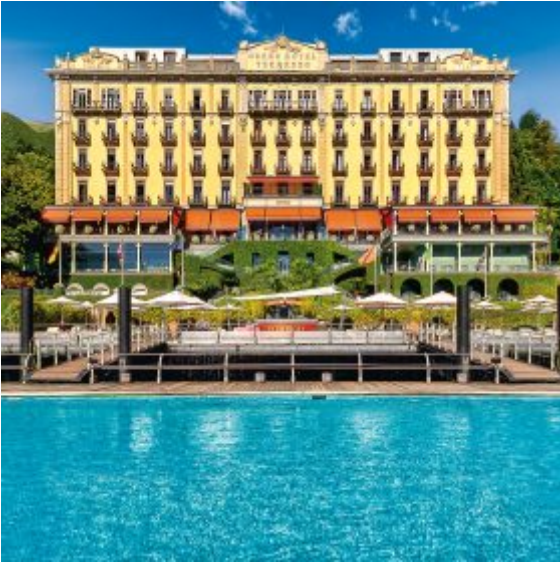
Grand Hotel Tremezzo