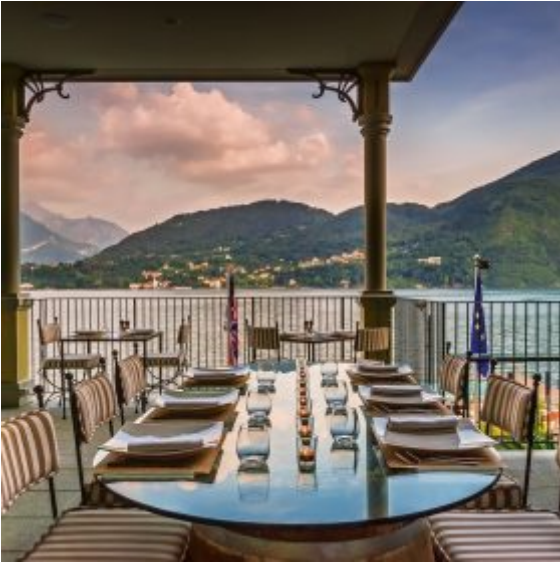
L'Escale Fondue & Wine Bar veranda