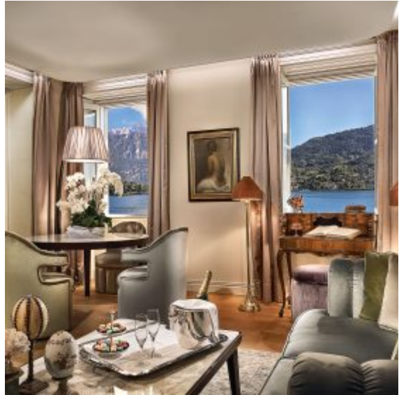
Suite Emilia - Living Room