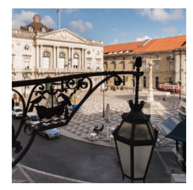
View from the Deluxe Rooms and Suites