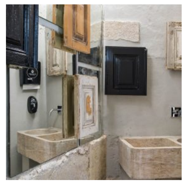
Interior public area