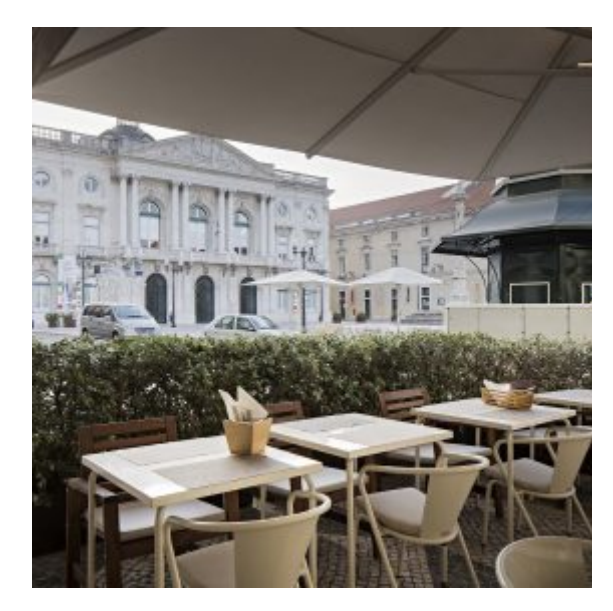
Terrace and view of the Square