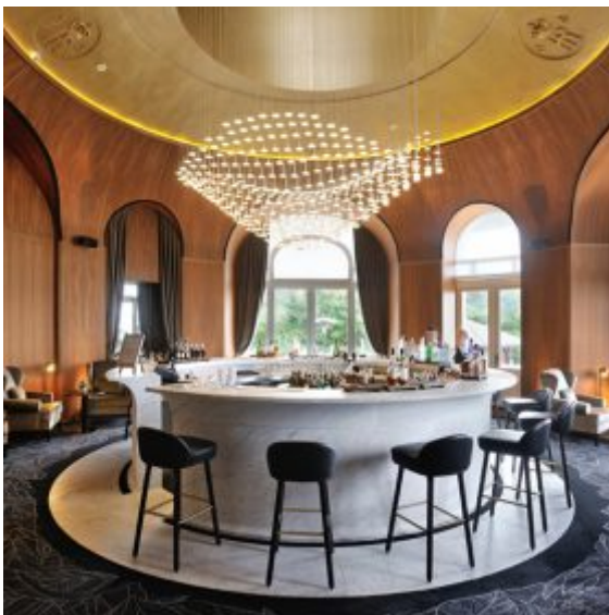
Hotel Royal bar