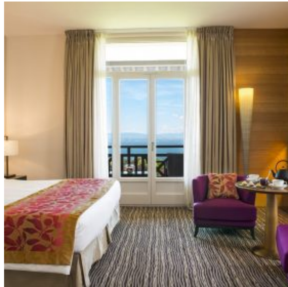
Hotel Ermitage Junior Suite