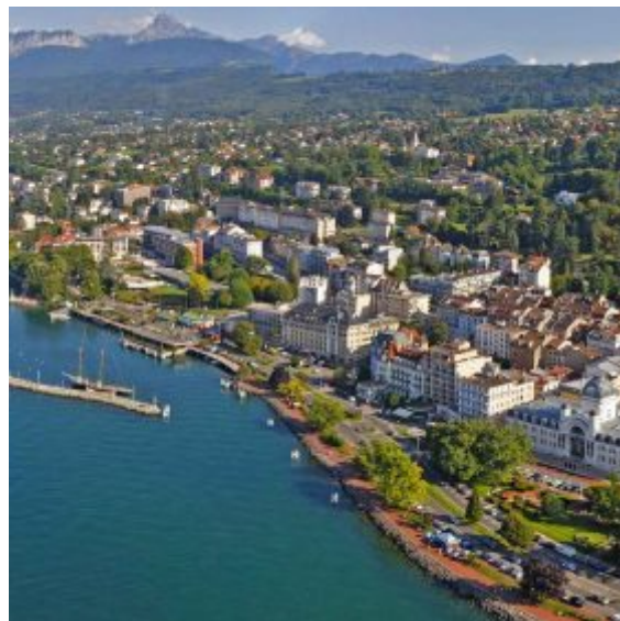
Évian-les-Bains - aerial view of resort