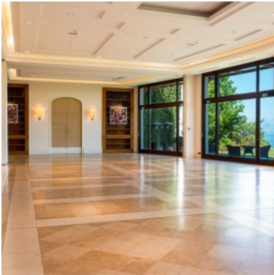
Event room with lake view