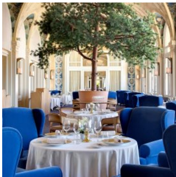
Les Fresques restaurant