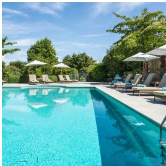
Hôtel Ermitage Swimming Pool