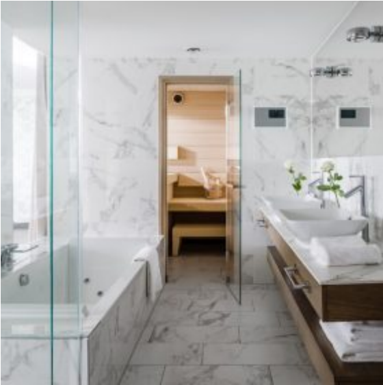
Bathroom, Villa Belgrano