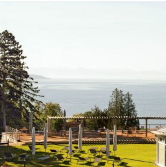
Terrasse Villa Bellevue