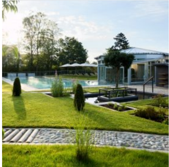
New Gardens & Swimming Pool