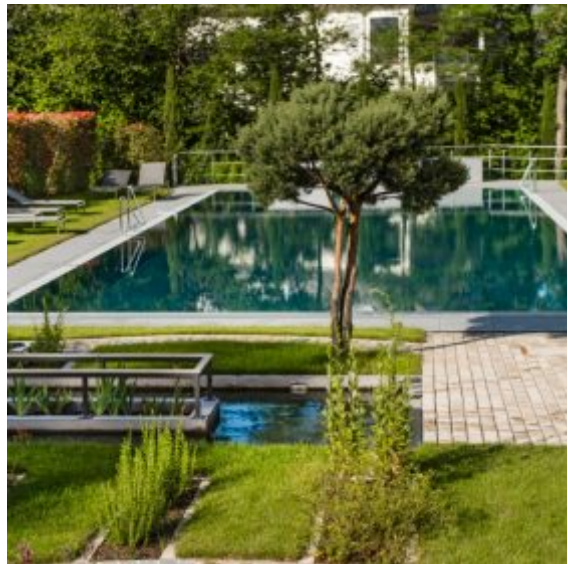
New Gardens & Swimming Pool