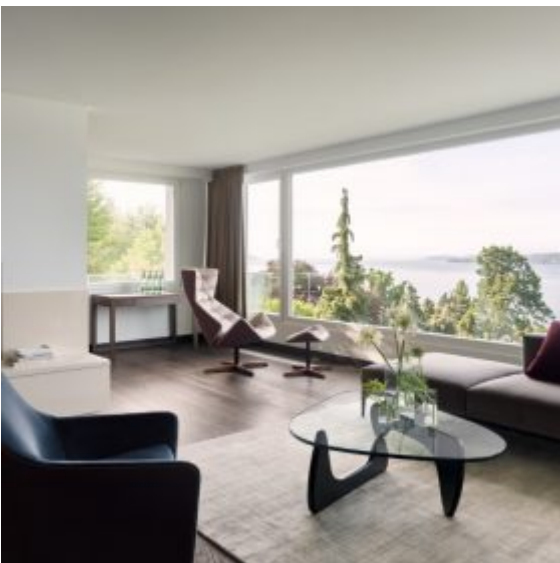
Suite Living Room, Villa Belgrano