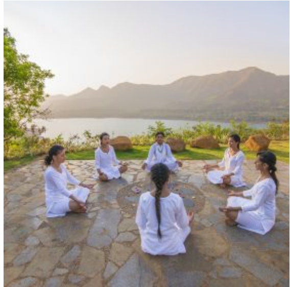
Meditation at Prana amphitheatre