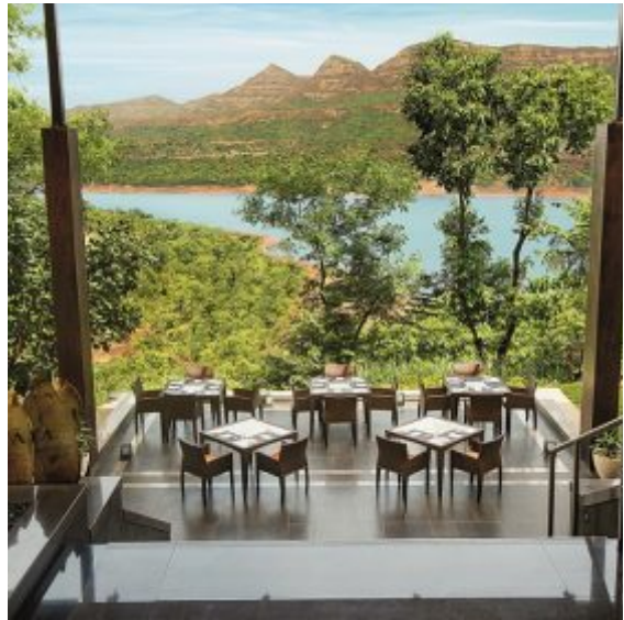
Dining pavilion and view