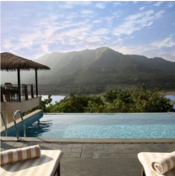
Mango Tree Villa pool and view