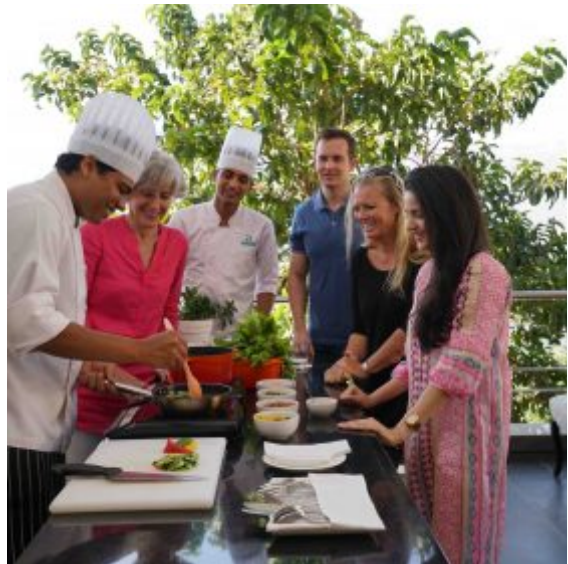
Spa Cuisine cooking classes