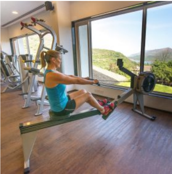
Shakti - The Gym