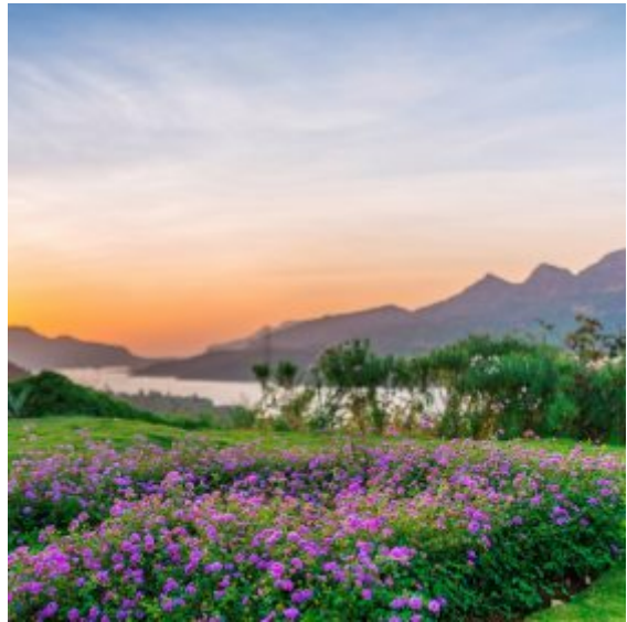
View from the Prana amphitheatre