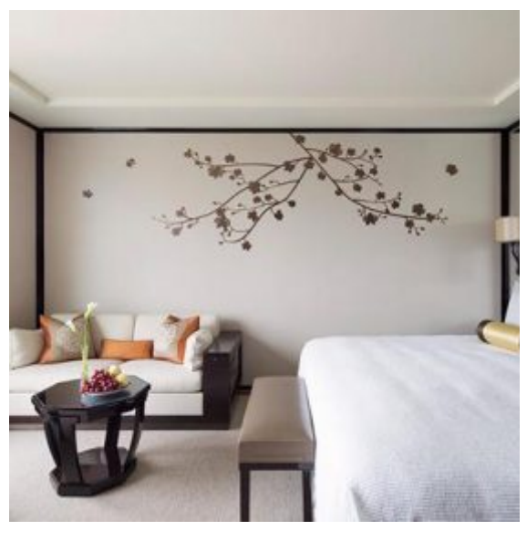
Grand Deluxe Harbour View Room