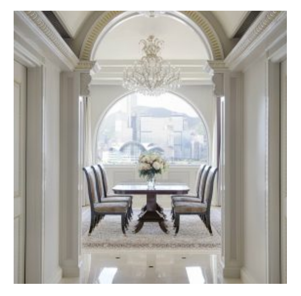
Marco Polo Suite