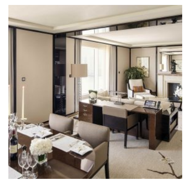
Grand Deluxe Harbour View Suite - Living & Dining Room