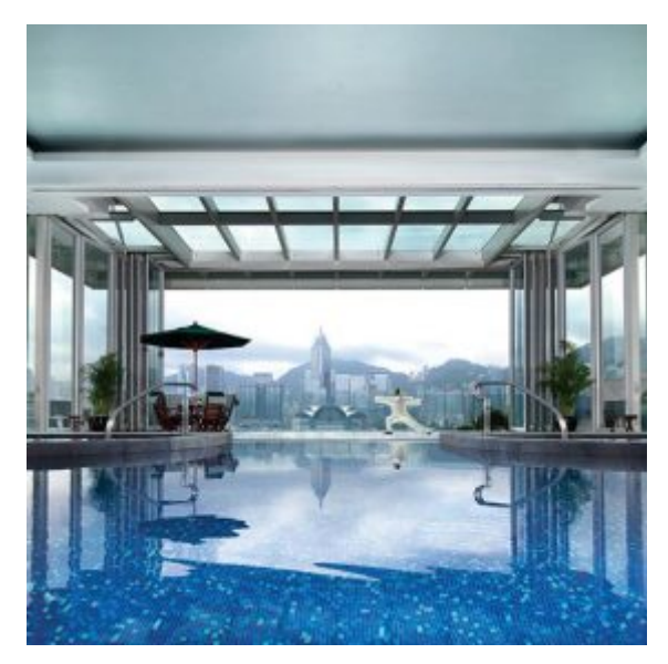
The Peninsula Spa Swimming Pool