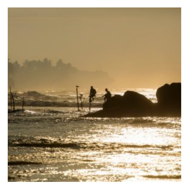
Sunset over the Water