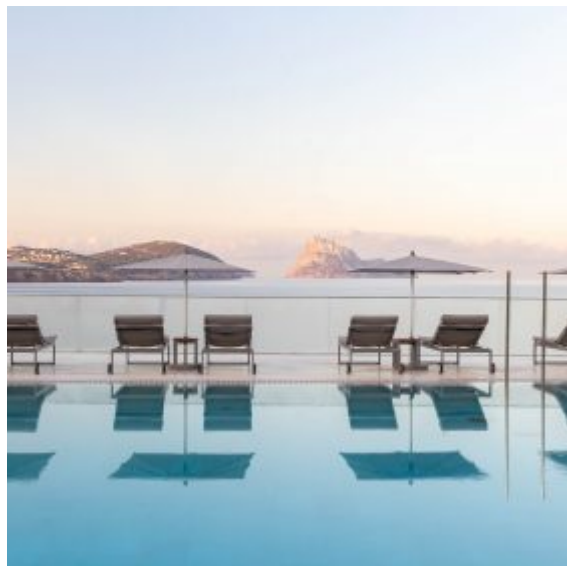
7Pines Infinity Pool