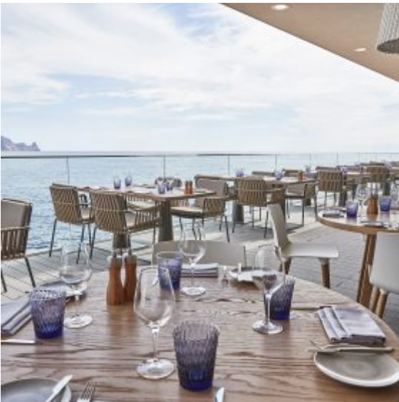
7Pines Dining- Exterior Sea View