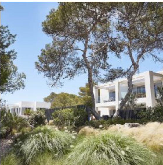
7Pines Garden Suite Exterior