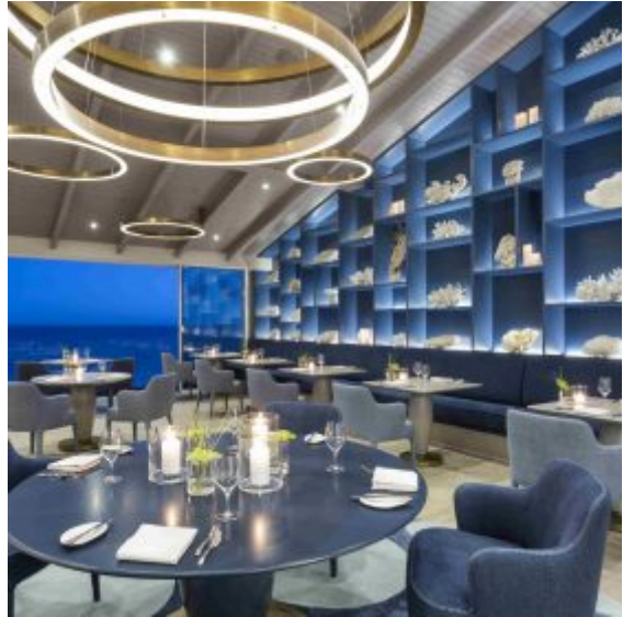
Two-Michelin starred, Ocean Restaurant