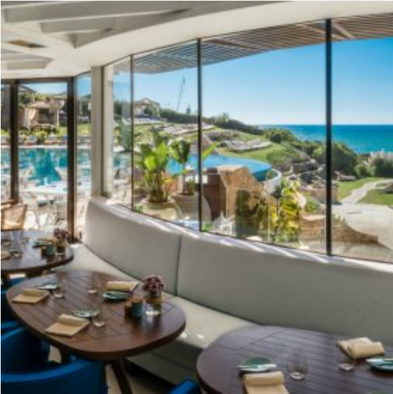
Whale bar and restaurant