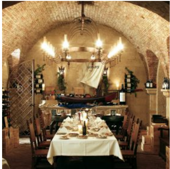
Cave dos Vinhos, wine cellar