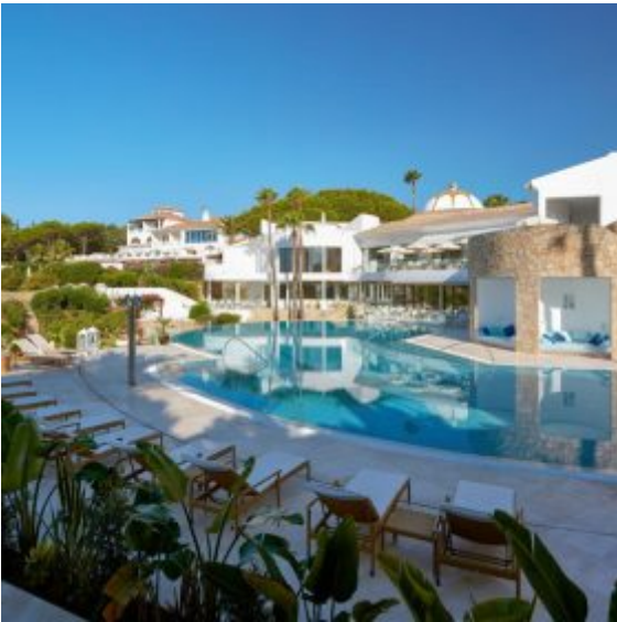
The Club House pool