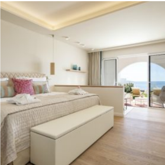
Deluxe Room, with Atlantic Ocean views