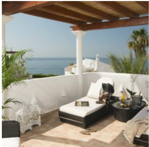
Oasis Suite terrace