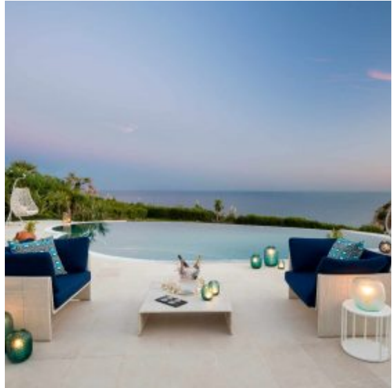
Villa Praia, one of the on-property villas