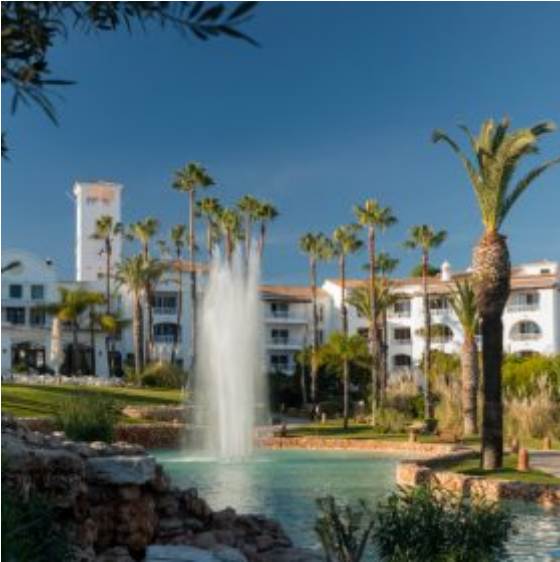
Main building and gardens