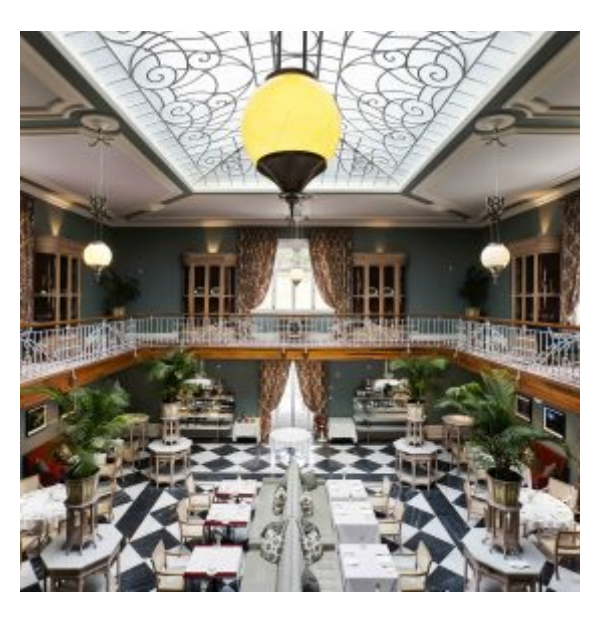
Winter Garden Restaurant