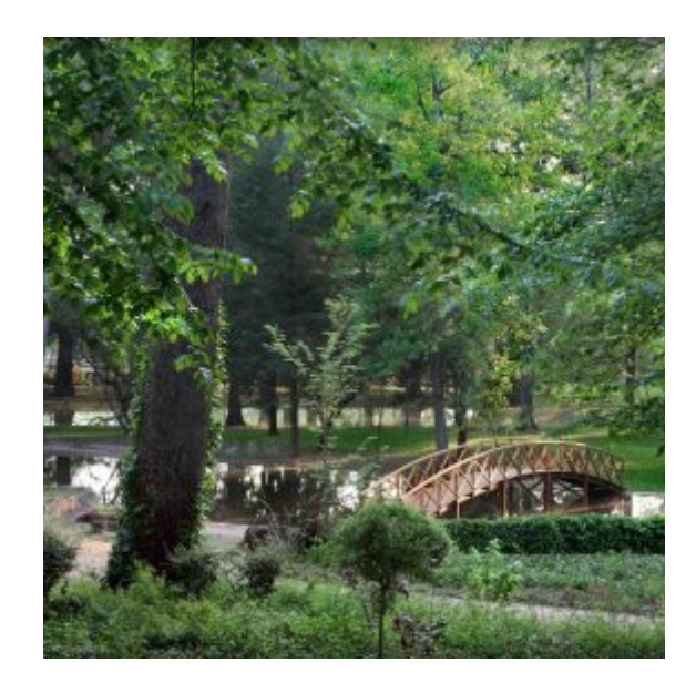
The Park and outdoor events space