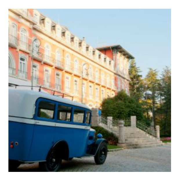
Vidago Palace Bus