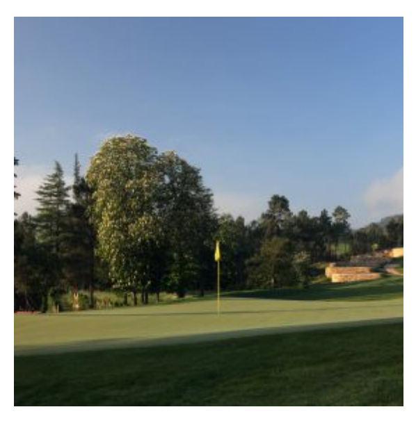
18-Hole Golf Course