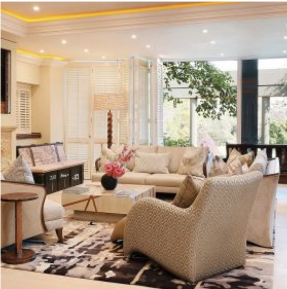
Nelson Mandela Platinum Suite