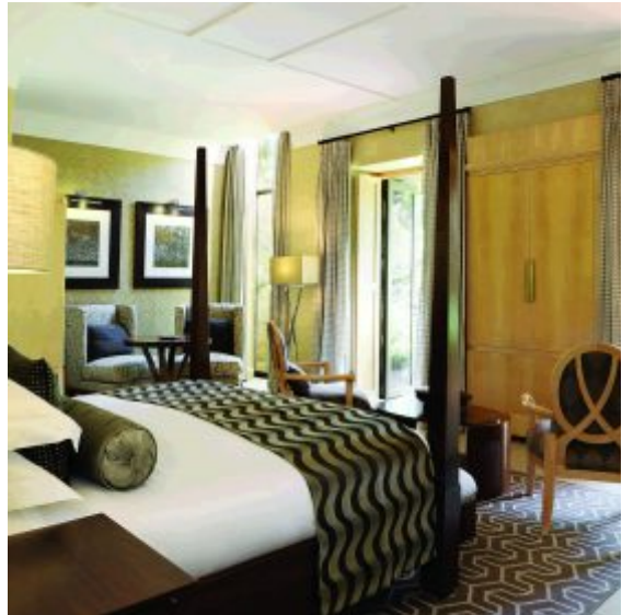
Saxon Executive Luxury Room