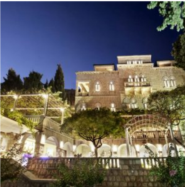
Villa Orsula by night

The property was originally built in 1939. Artists Roberto Matta and Victor Vasarely were amongst those who worked on its immaculately refurbished interiors. Large canvases of the distinctive architecture of the Old Town feature throughout