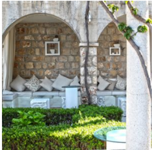
Villa Orsula gardens