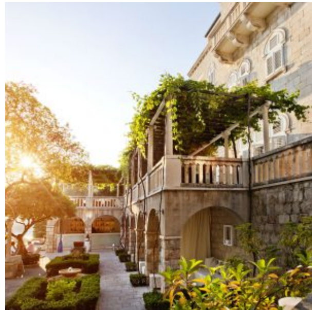
Villa Orsula Victoria Restaurant terrace