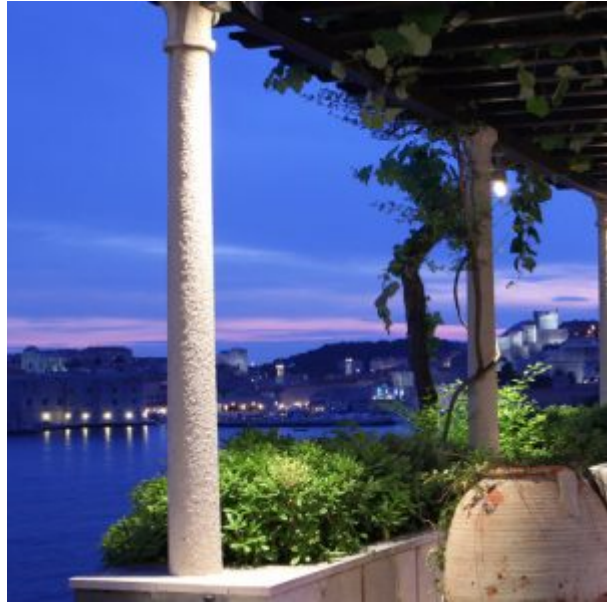
Villa Orsula Dubrovnik Old Town view