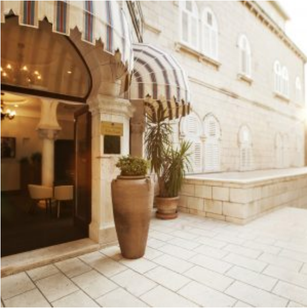
Villa Orsula entrance