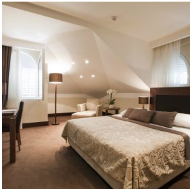
Villa Orsula Deluxe Suite