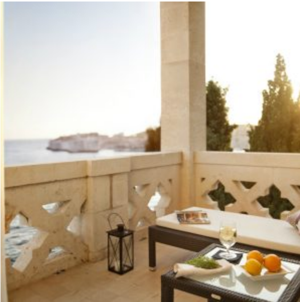
Villa Orsula Royal Suite balcony