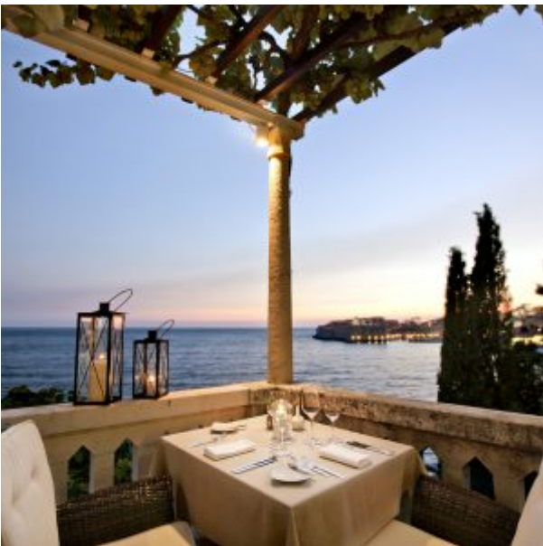
Villa Orsula Victoria Restaurant