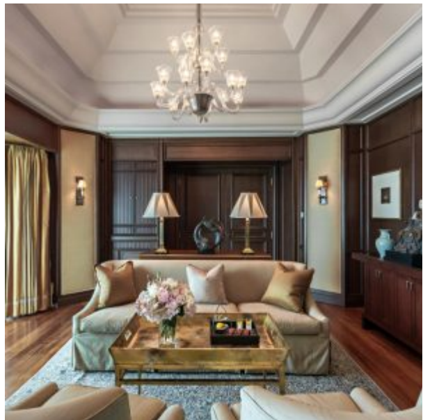
The Peninsula Suite