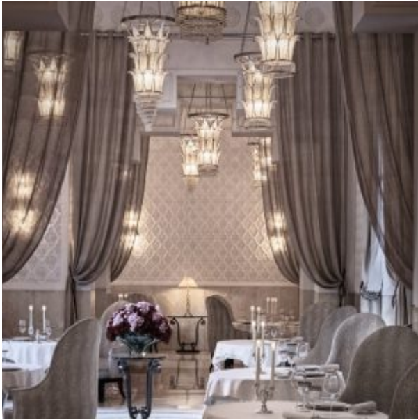
La Grande Table Francaise