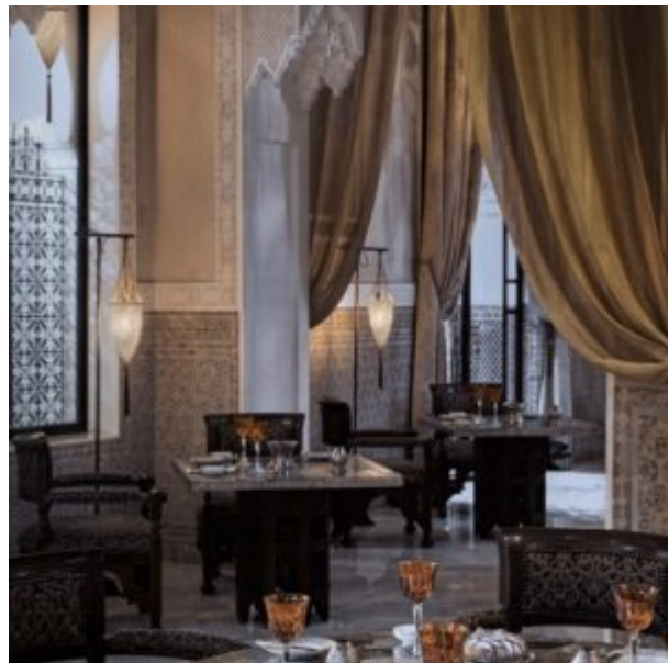
La Grande Table Marocaine