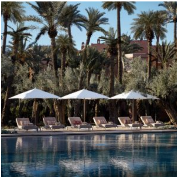
Le Jardin Pool