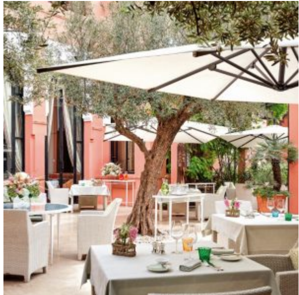
La Table restaurant