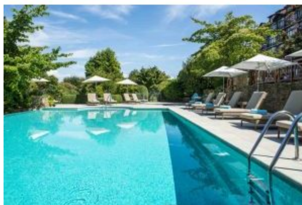
Hôtel Ermitage Swimming Pool