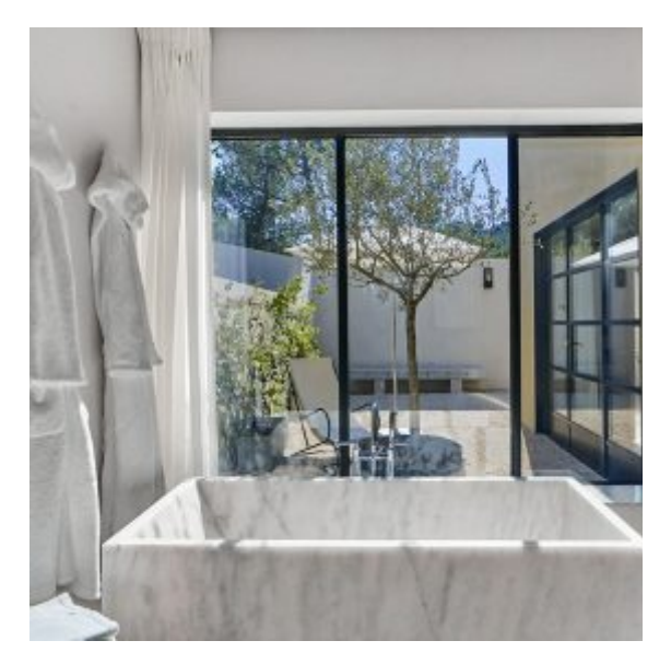
A Villa Suite at Villa La Coste