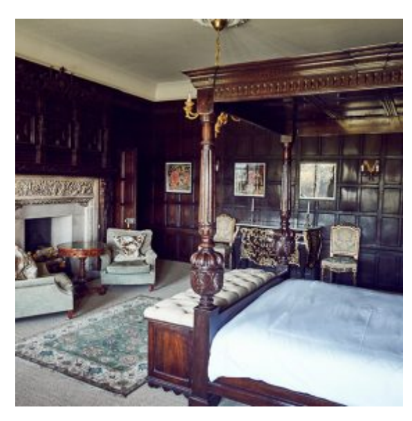
A bedroom at Cowdray House, West Sussex