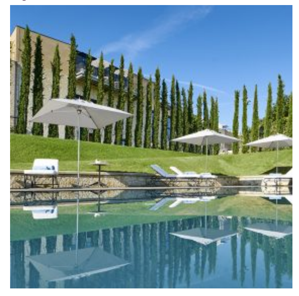
The Pool at Villa La Coste