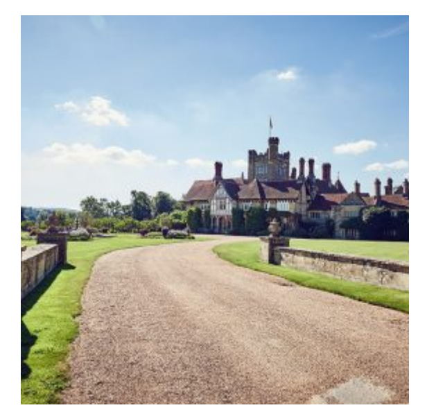
The 110-Acre Setting of Cowdray House, West Sussex