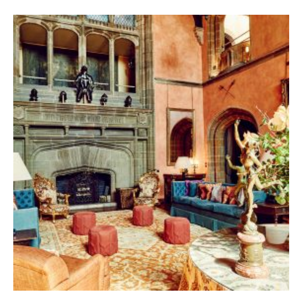
The Hall at Cowdray House, West Sussex