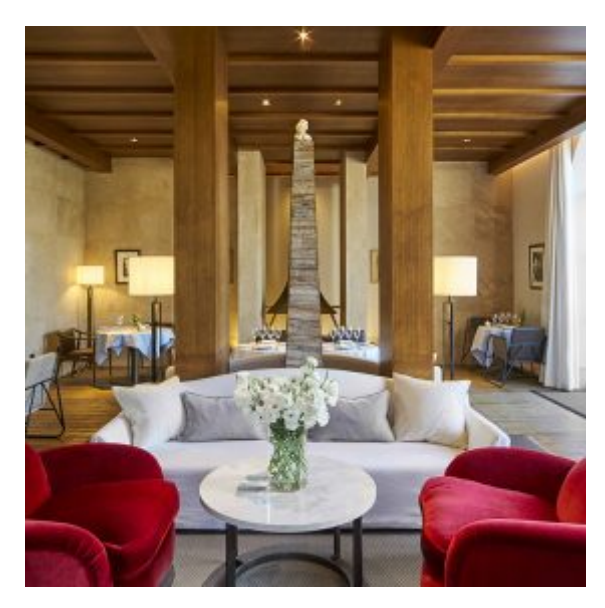
Villa La Coste, Provence