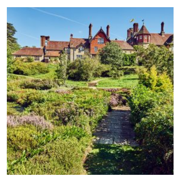
The gardens at Cowdray House, West Sussex