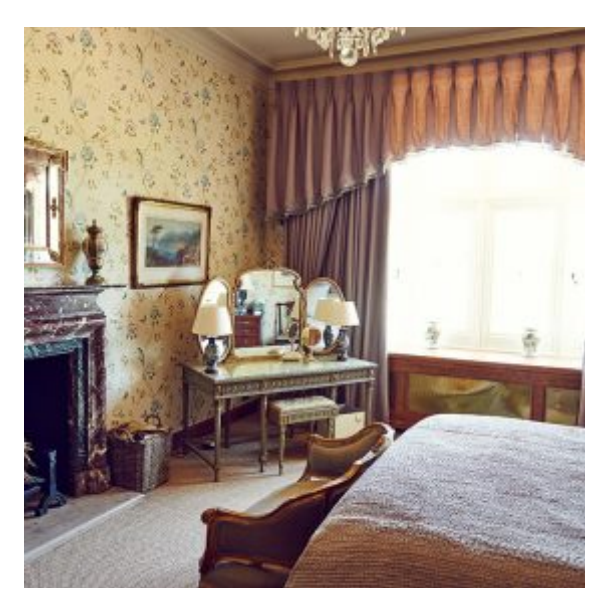
A bedroom at Cowdray House, West Sussex