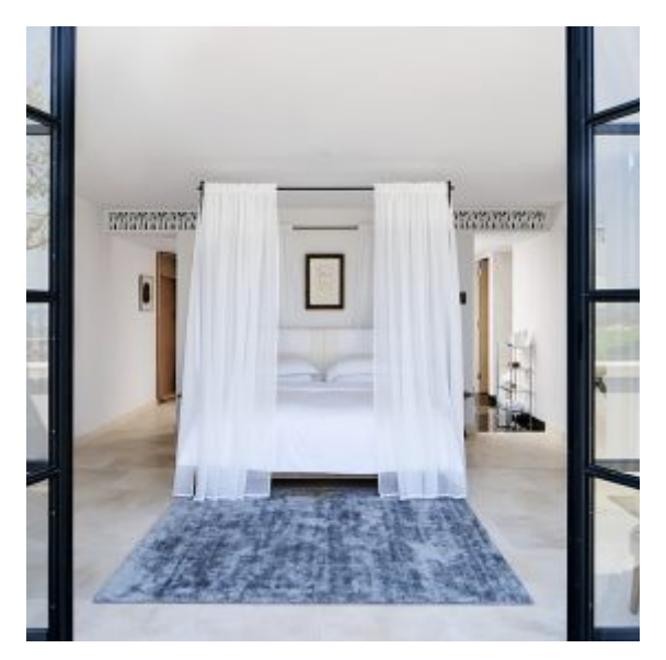
A Villa Suite, each offers zen uncluttered comfort with expansive views.